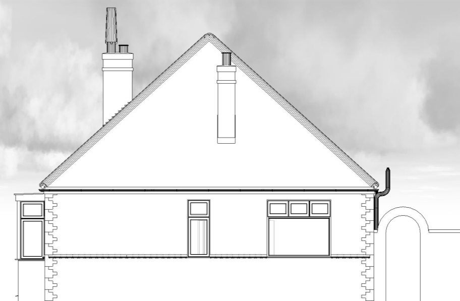
2C Existing East Elevation. drawing scale 1:100