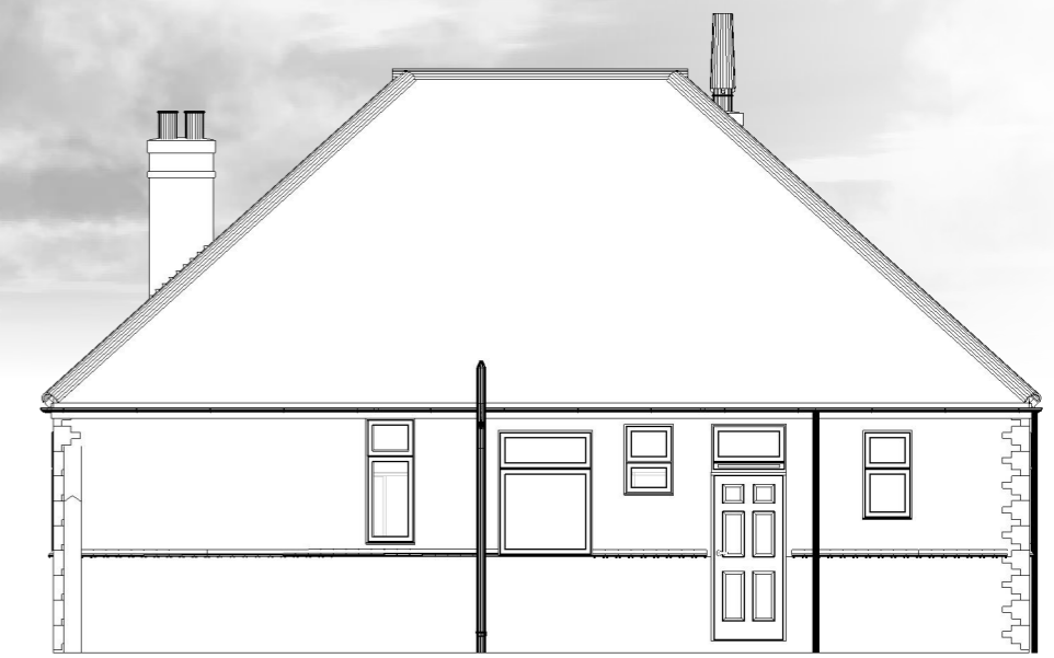
4C Existing North Elevation. drawing scale 1:100