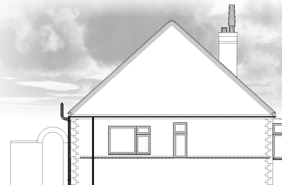
3C Existing West Elevation. drawing scale 1:100