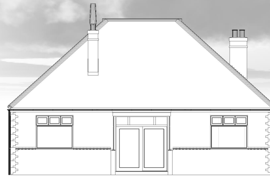
1C Existing South Elevation. drawing scale 1:100