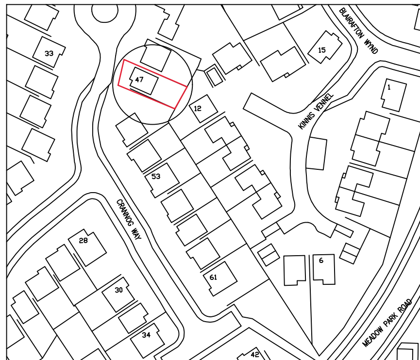
LOCATION PLAN AS EXISTING 1:1250