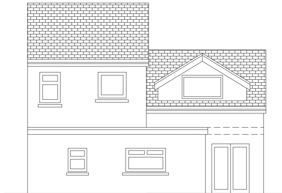
PROPOSED SOUTH SIDE ELEVATION (REAR)