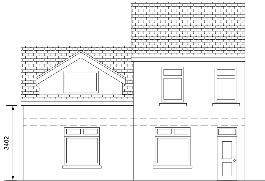
PROPOSED NORTH SIDE ELEVATION (FRONT)