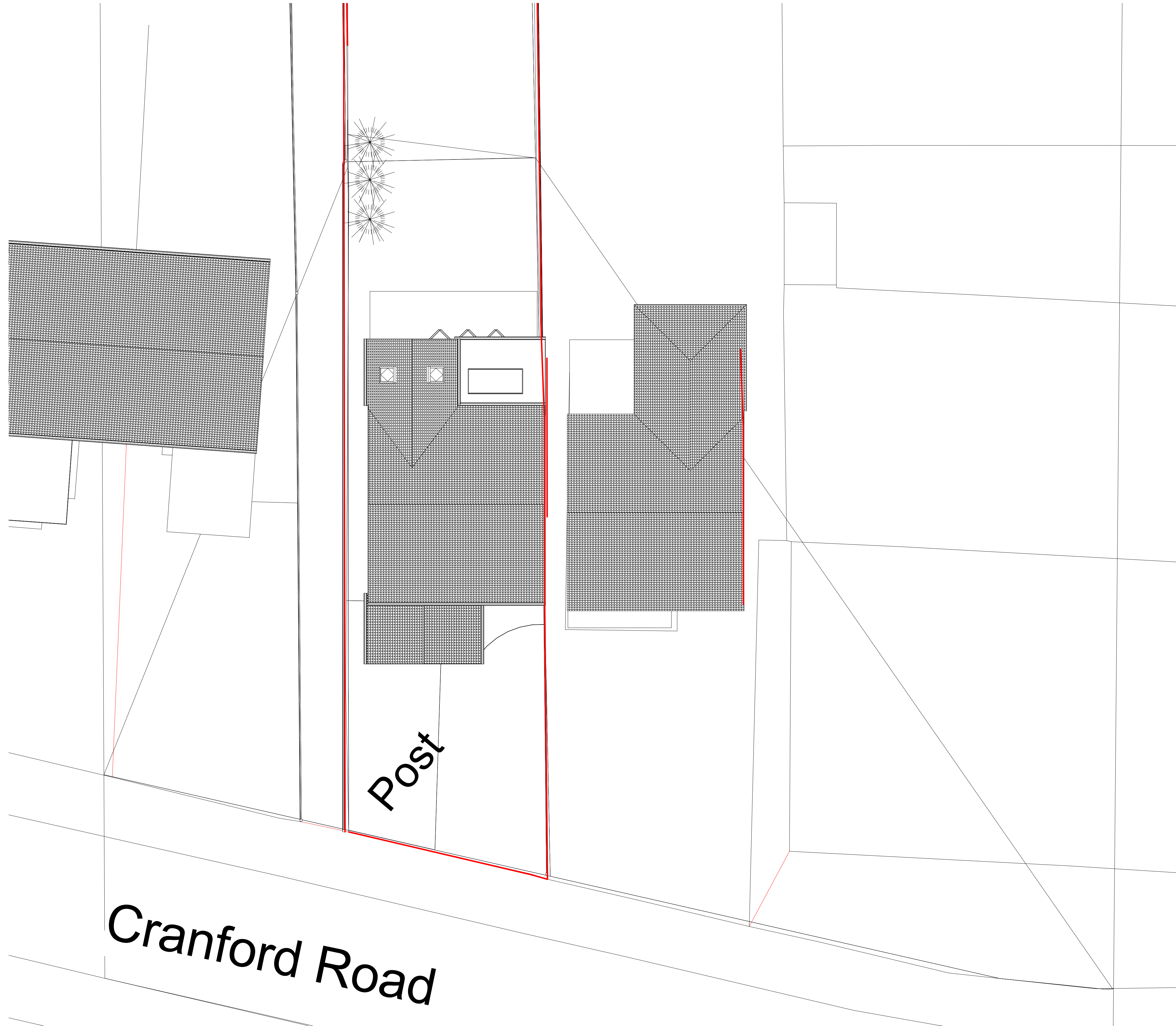
1 Proposed Site Plan 1 : 100

General Notes This drawing is to be read in conjunction with all relevant design team specifications and drawings. All dimensions are to be checked on site prior to commencement of work any discrepancies reported to the Project Architect. All materials and components are to be handled, stored, protected, installed and finished strictly in accordance with the manufacturer's recommendations. Copyright RK Architectural Services Limited