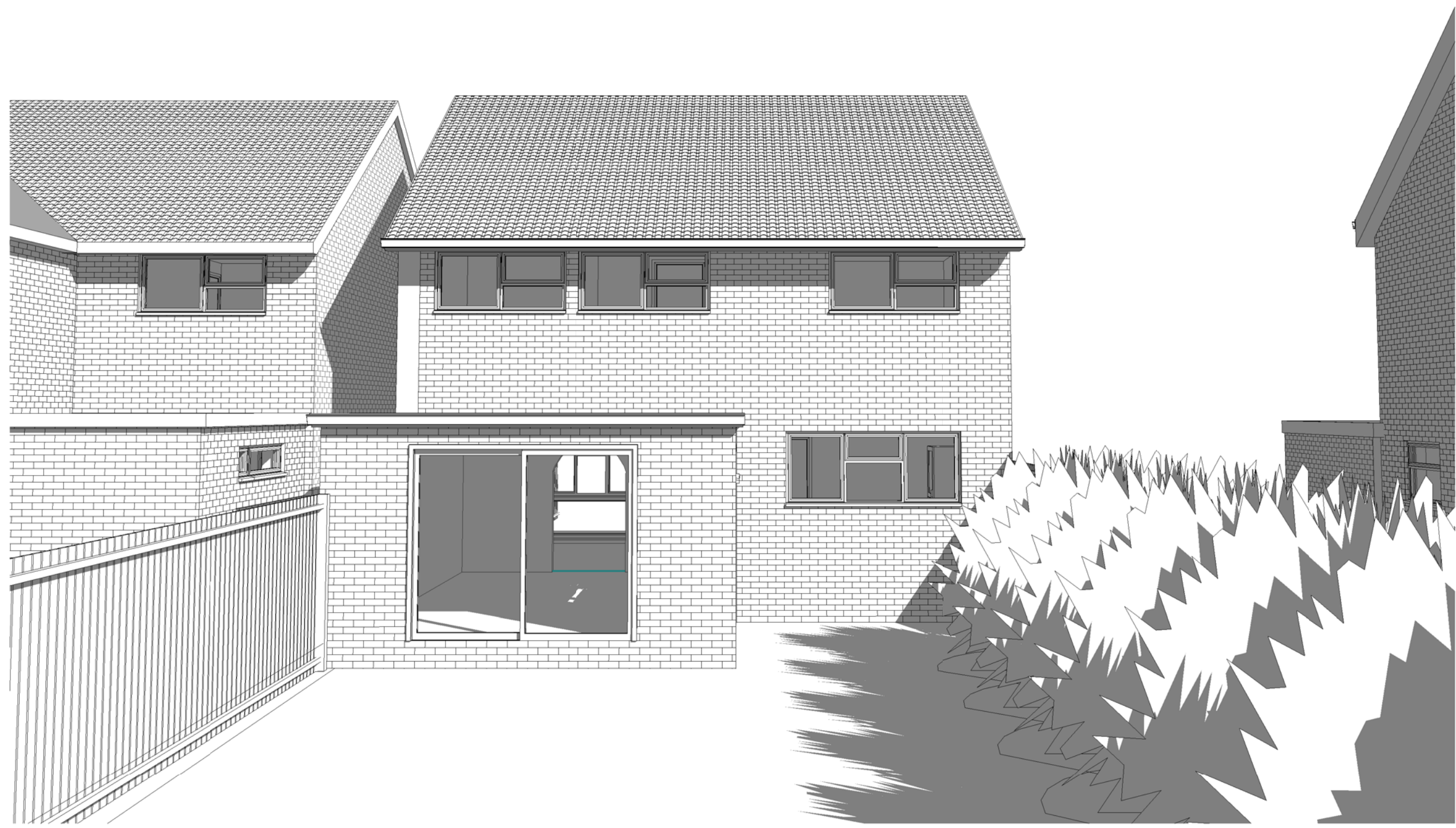
4 Existing View 2