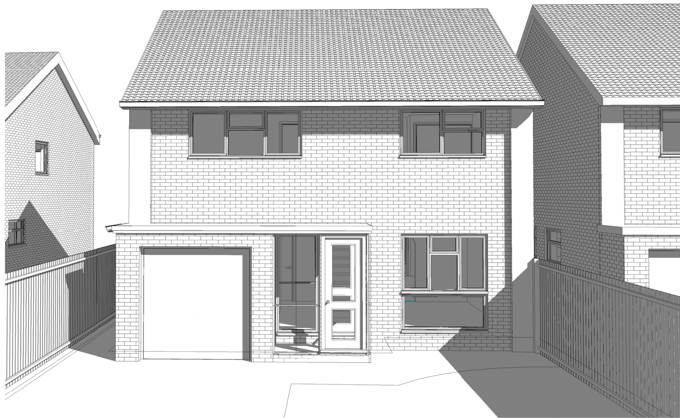
3 Existing View 1