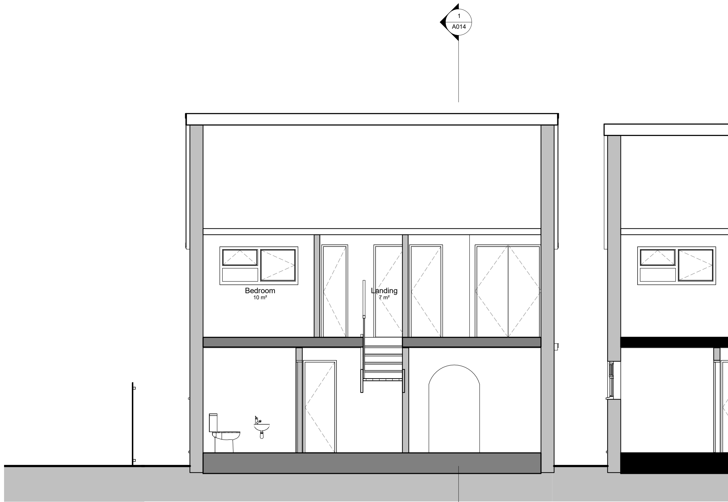
2 Section 2 1 : 50