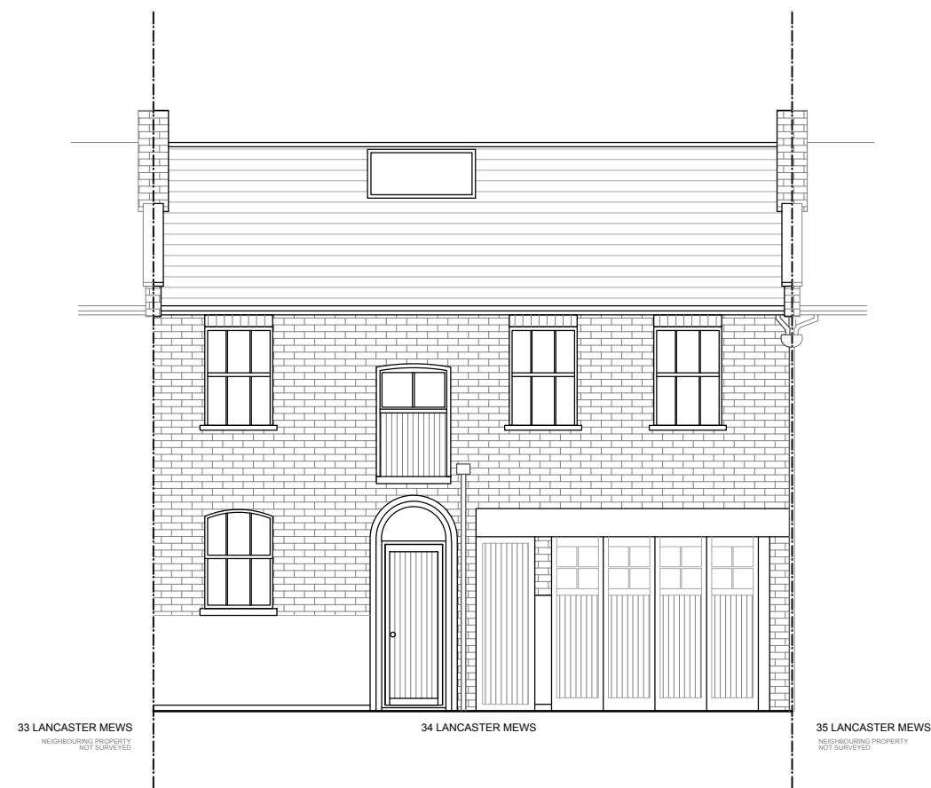
1 FRONT ELEVATION 05

Notes: Do not scale from this drawing. All dimensions must be checked on site prior to manufacture. Any errors discovered to be highlighted to AJK Architecture + Design Ltd. All rights reserved. No reproduction, in any form, is permitted without prior written consent. Copyright AJK Architecture + Design Ltd 2016 ©