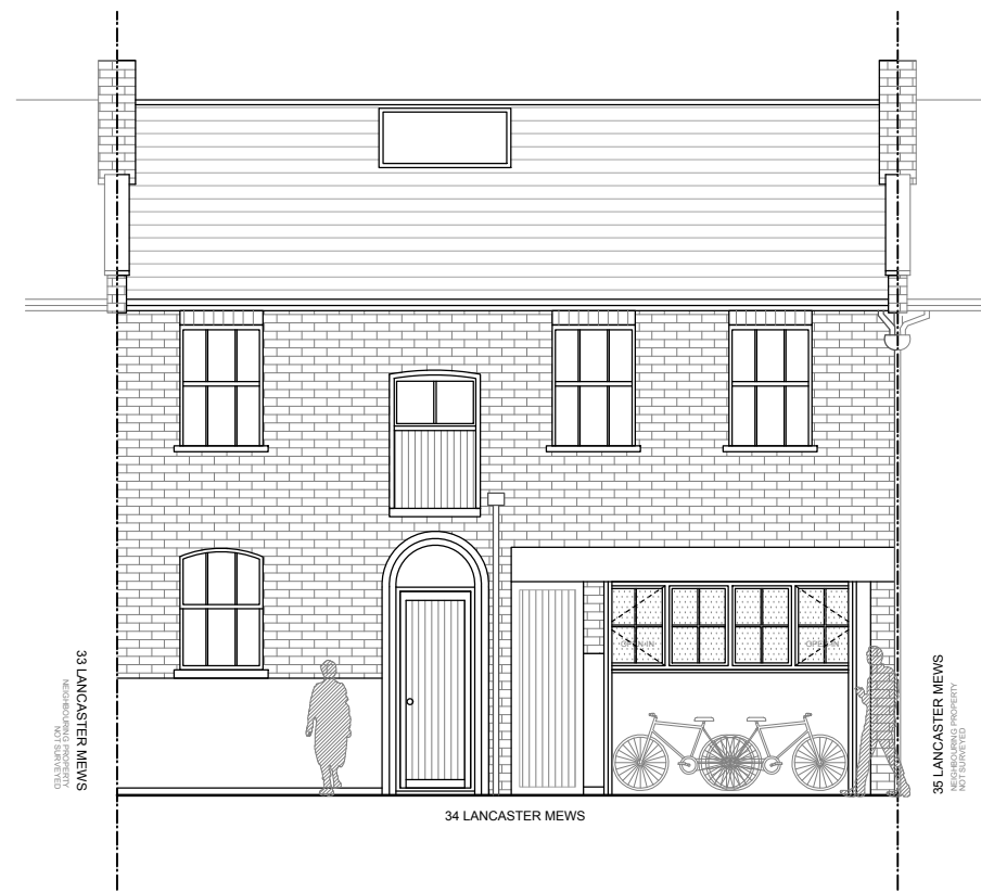
1 05 FRONT ELEVATION - OPEN - BIKE STORE

These plans are based on traced survey undertaken IN FEB 2020. No liability can be accepted for any inaccuracy. The client and third parties should rely on their own information. notwithstanding this the drawings are a fair representation of the premises for present purposes. copyright is held by the author; no unauthorised use shall be made of the drawings. given dimensions are in mm.