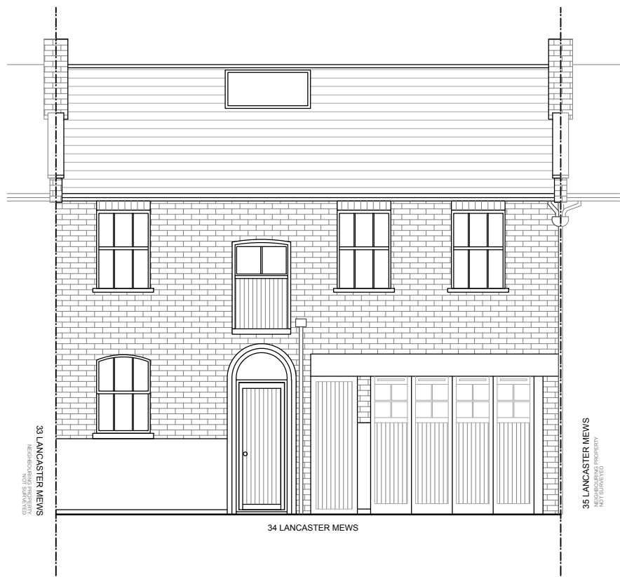
1 05 FRONT ELEVATION - CLOSED

Notes: Do not scale from this drawing. All dimensions must be checked on site prior to manufacture. Any errors discovered to be highlighted to AJK Architecture + Design Ltd. All rights reserved. No reproduction, in any form, is permitted without prior written consent. Copyright AJK Architecture + Design Ltd 2016 ©