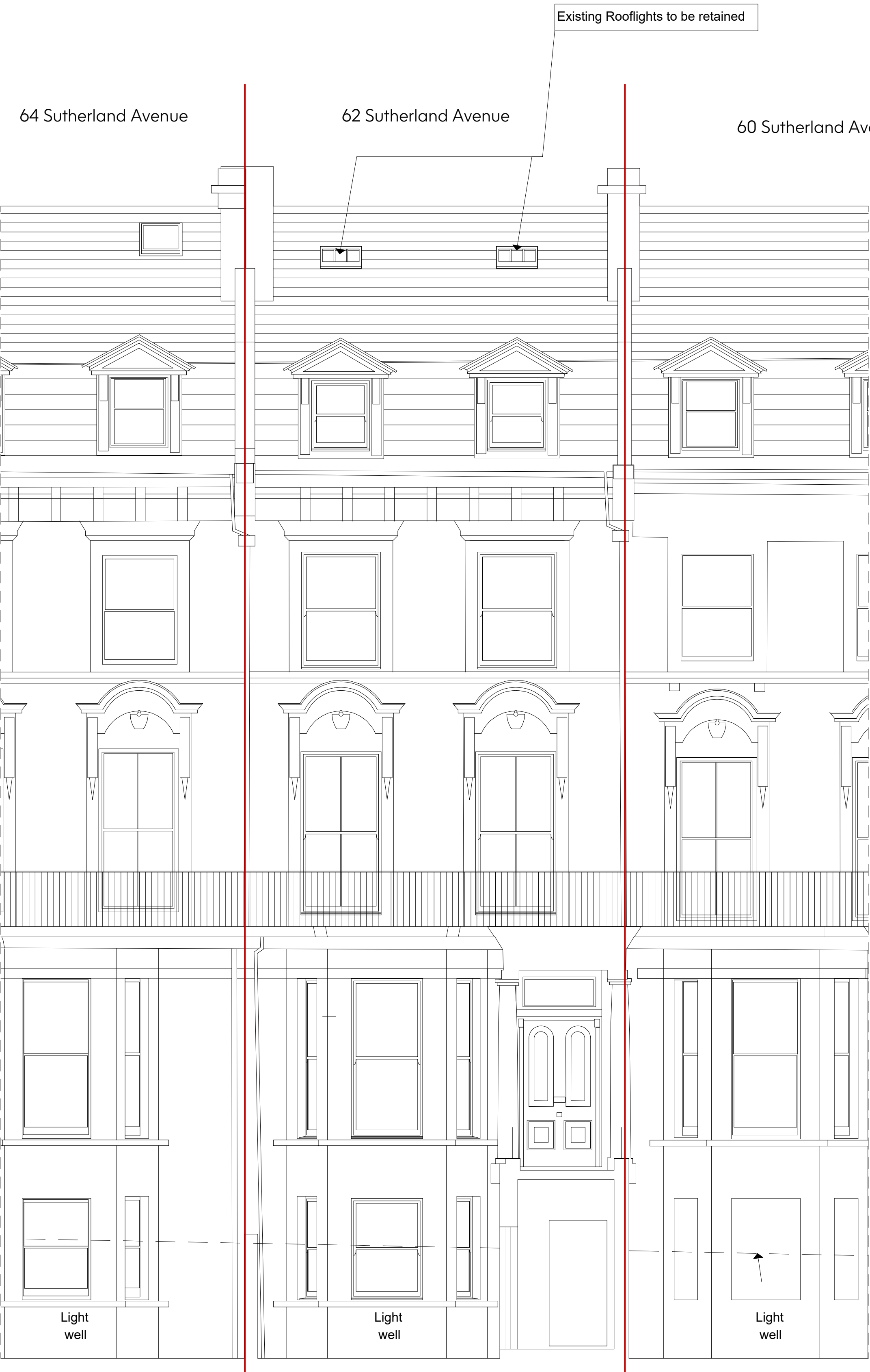
1 Proposed Front Elevation Scale 1:50