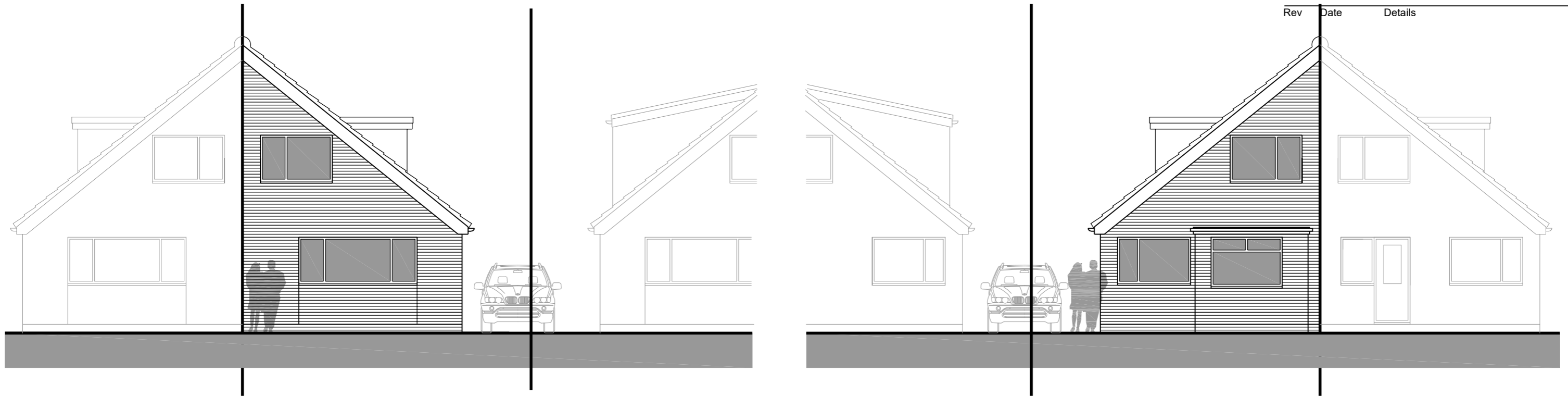
EXISTING ELEVATION SOUTH

All dimensions in millimetres . Where dimensions are not given, drawings must not be scaled and the matter referred back to the Architect. All dimensions and conditions are to be checked on site by the contractor prior to commencing any work. The contractor is responsible for checking that there is no conflict between site dimensions and drawn dimensions.