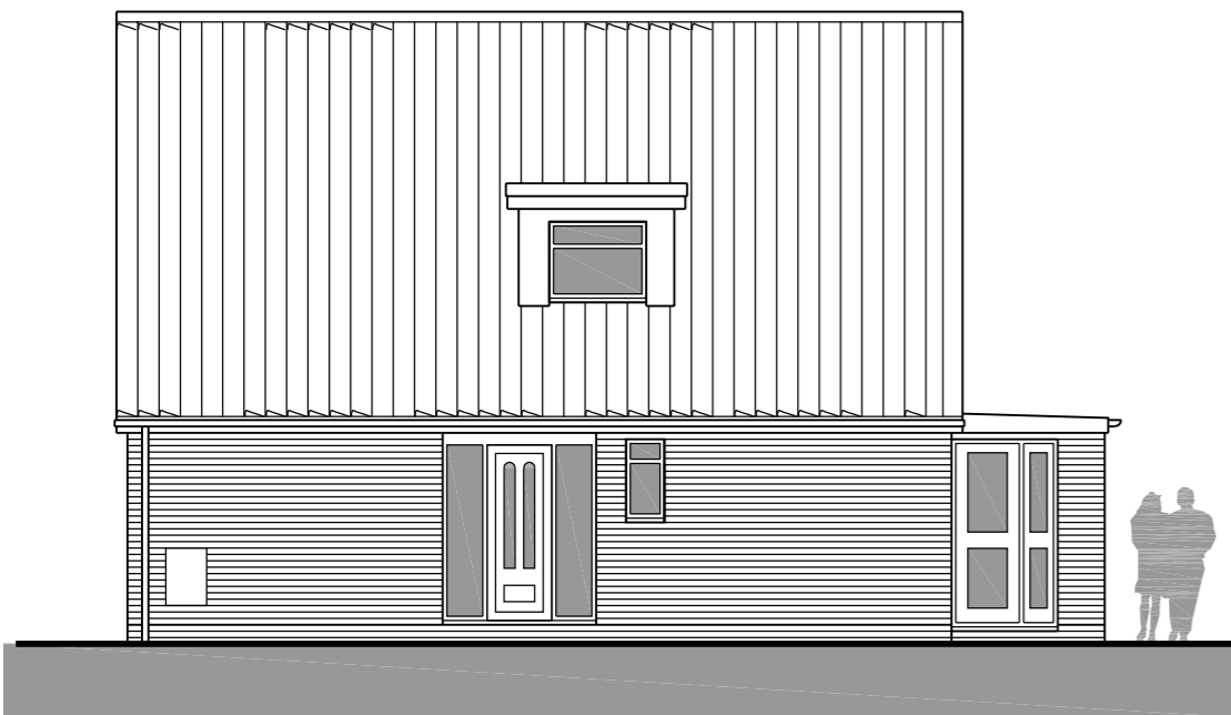
EXISTING ELEVATION NORTH