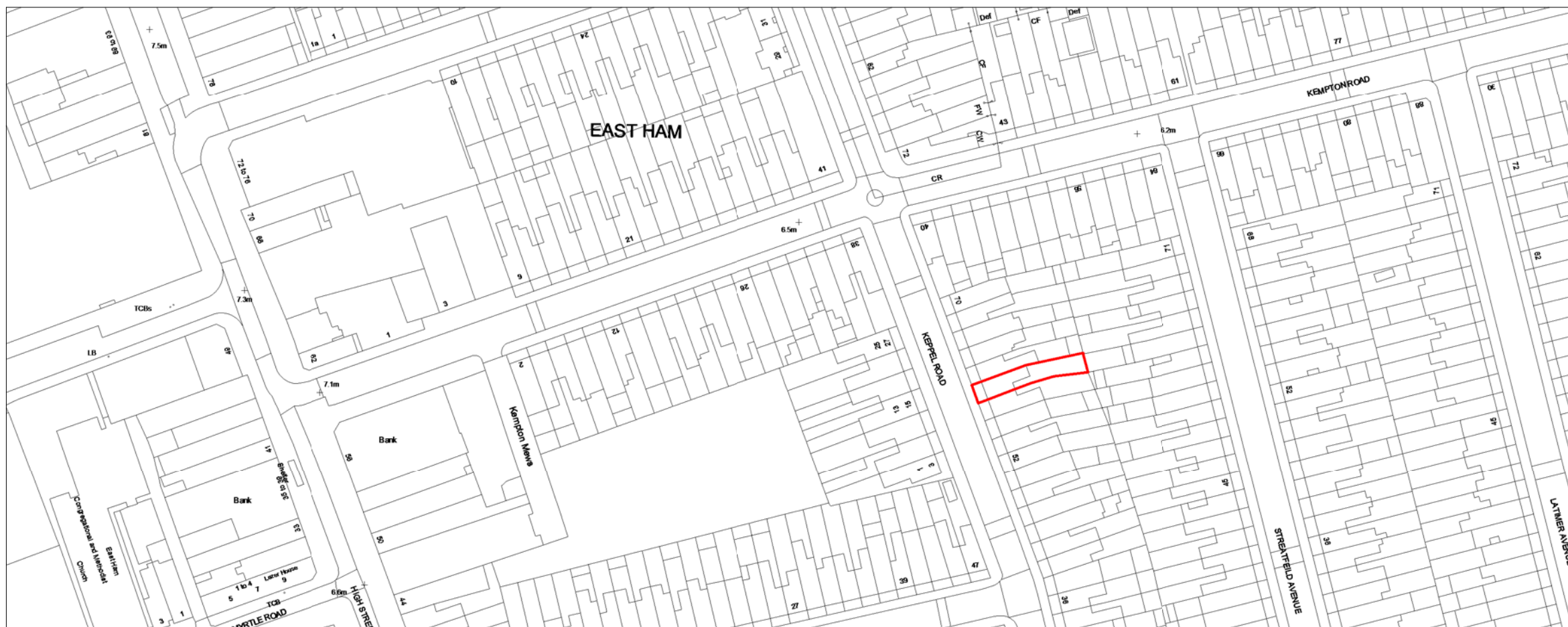
2 LOCATION PLAN 1 : 1250