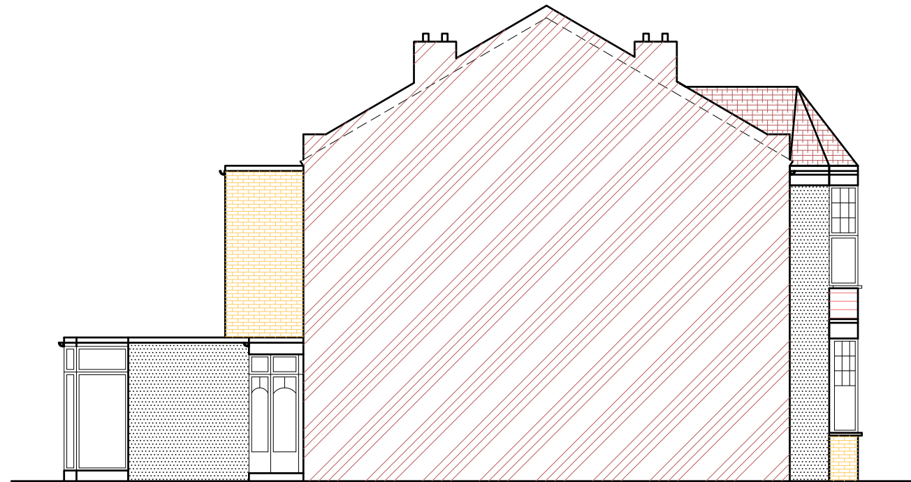
Existing Side Elevation - B