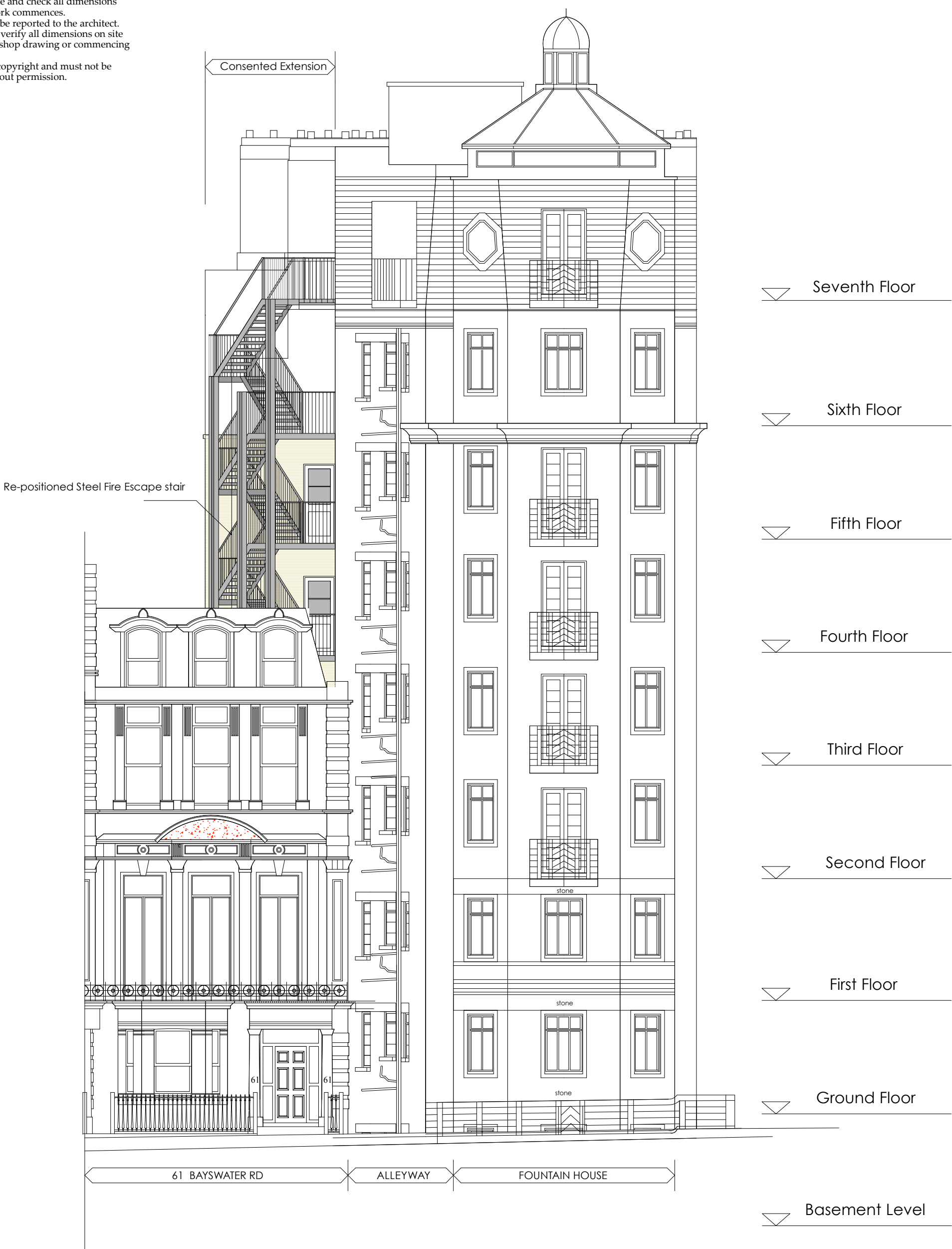
Proposed Street Elevation to Bayswater Road

Do not scale from this drawing except for planning purposes. Contractor to take and check all dimensions on site before work commences. Discrepancies to be reported to the architect. Subcontractor to verify all dimensions on site before making a shop drawing or commencing manufacture. This drawing is copyright and must not be reproduced without permission.