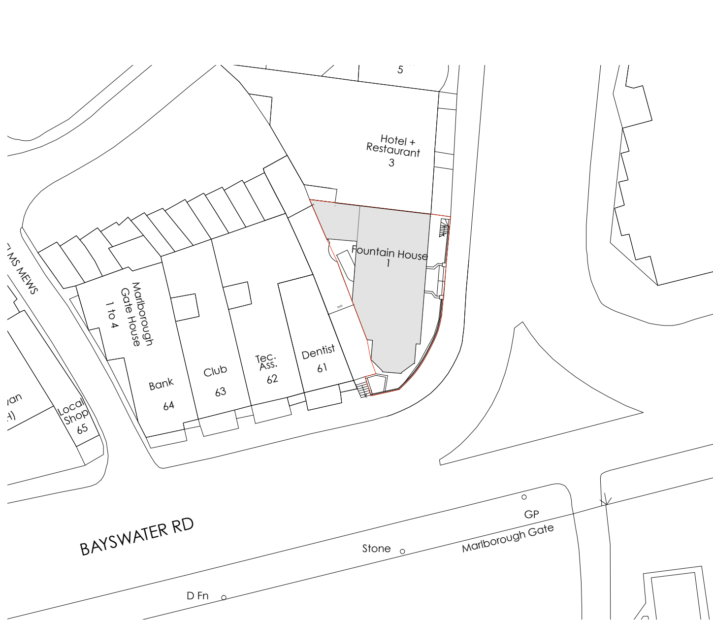
Existing Block Plan