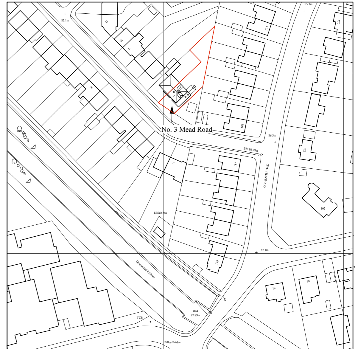
OS Map scale 1:1250