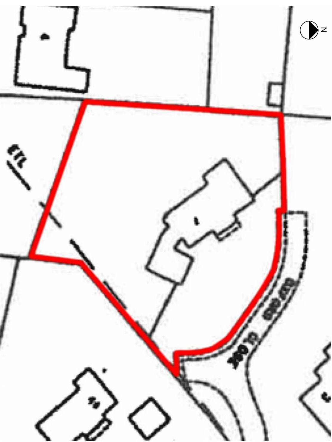
SITE BLOCK PLAN SCALE 1:500 @ A3