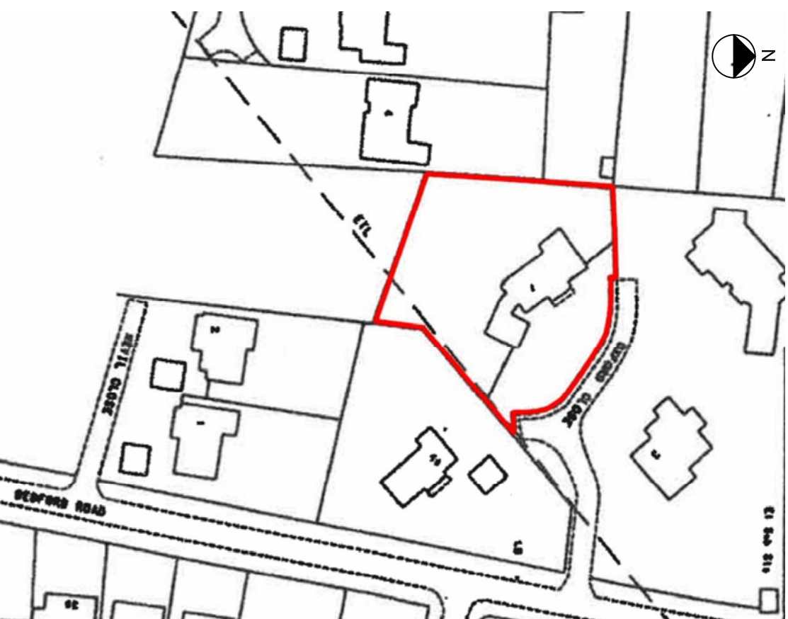
SITE LOCATION PLAN SCALE 1:1250 @ A3