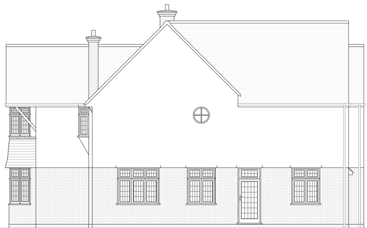
EXISTING & PROPOSED NORTH ELEVATION