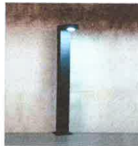
INDICATIVE BOLLARD DOWN LIGHT