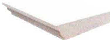
TYPICAL STONE COPING MODEL SHOWN IS CS45 FROM ACANTHUS