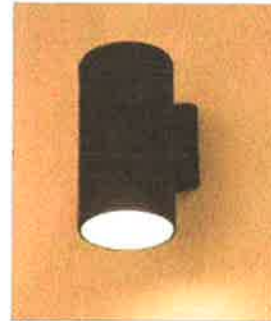
INDICATIVE WALL DOWN LIGHT