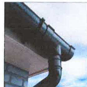
ALUMINIUM CAST IRON AFFECT RAINWATER GOODS - CIRCULAR DOWNPIPE AND HALF ROUND GUTTER TO MATCH EXISTING