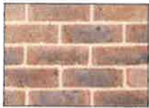
PROPOSED BRICKWORK -FLB HANDMADE