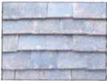
PROPOSED TILES FOR ROOF DEVELOPER RANGE FROM TRADITIONAL CLAY ROOF TILES LTD - COLOUR: DARK