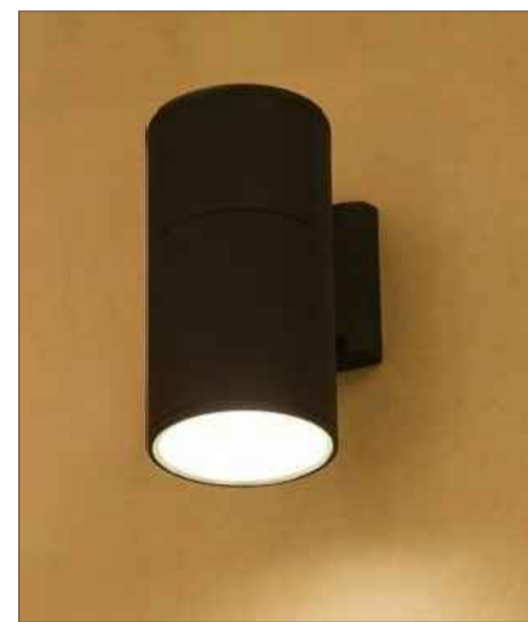
INDICATIVE WALL DOWN LIGHT