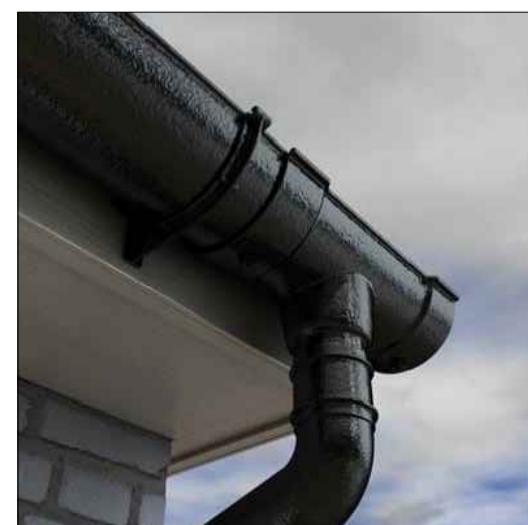
ALUMINIUM CAST IRON AFFECT RAINWATER GOODS - CIRCULAR DOWNPIPE AND HALF ROUND GUTTER TO MATCH EXISTING