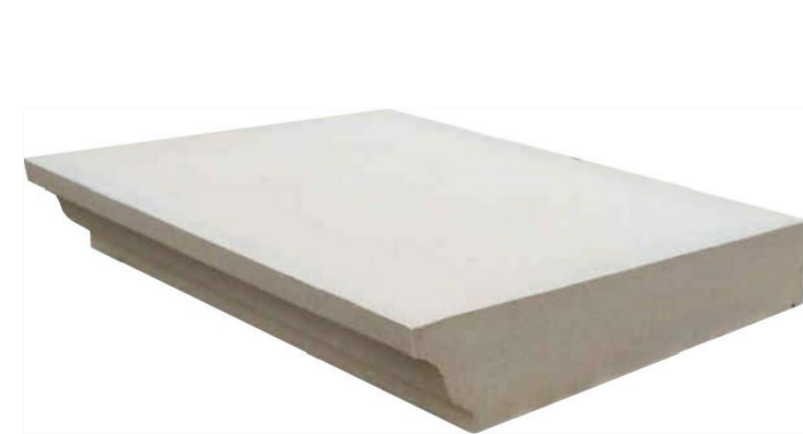
TYPICAL STONE COPING MODEL SHOWN IS CS45 FROM ACANTHUS