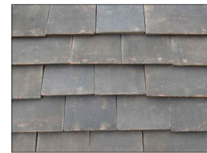
PROPOSED TILES FOR ROOF DEVELOPER RANGE FROM TRADITIONAL CLAY ROOF TILES LTD - COLOUR: DARK