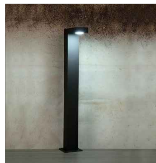
INDICATIVE BOLLARD DOWN LIGHT