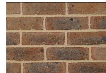
PROPOSED BRICKWORK -FLB HANDMADE