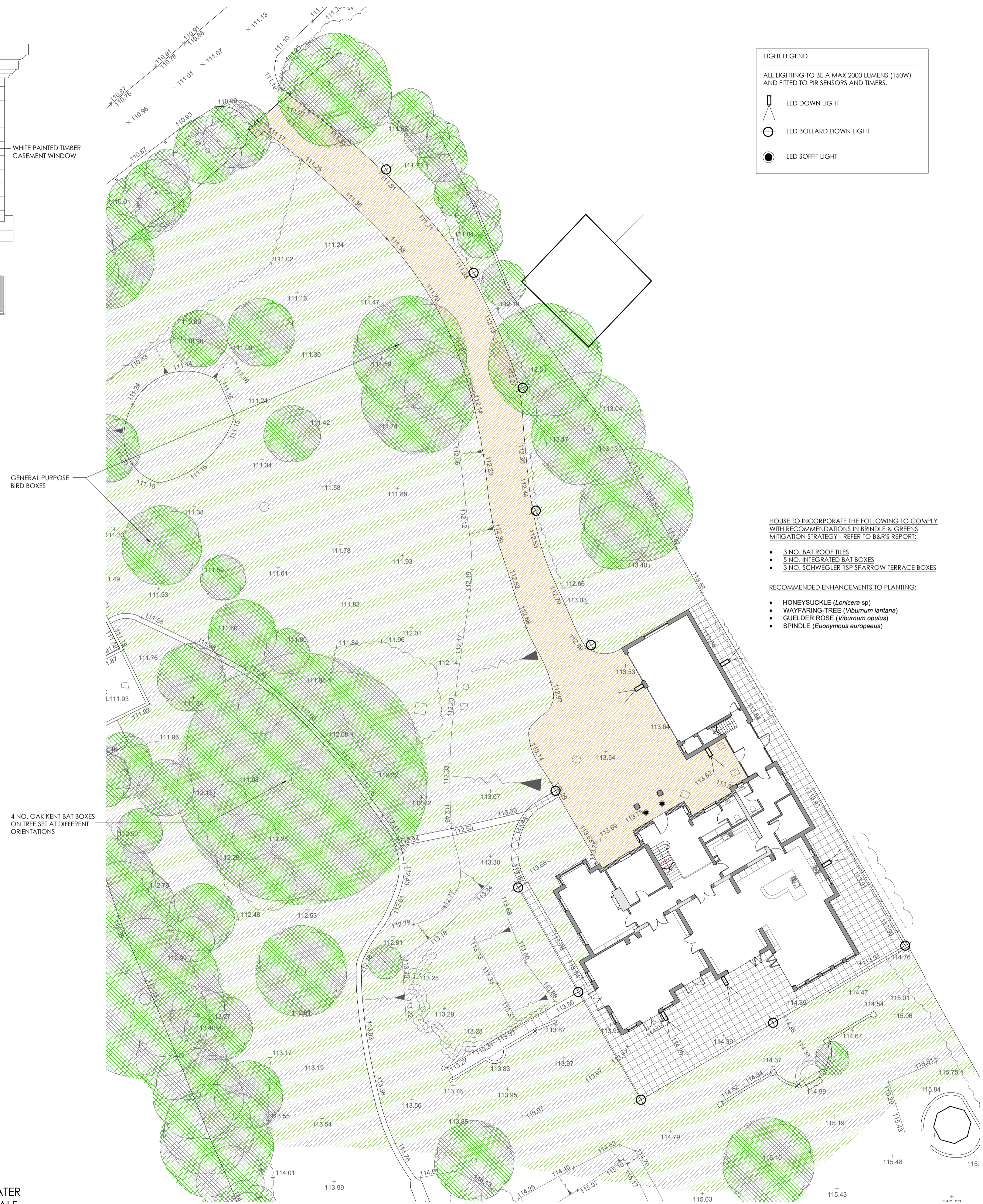
SITE PLAN SHOWING PROPOSED LIGHTING SCALE 1:200

REFER TO BIRD & BAT MITIGATION STRATEGY REPORT BY BRINDLE & GREENS ECOLOGICAL CONSULTANTS LTD FOR PROPOSALS FOR BIRD AND BAT BOX RECOMMENDATIONS