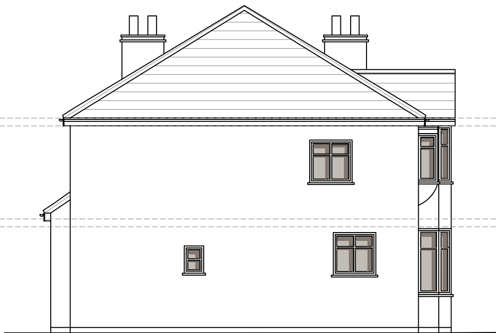
EXISTING SIDE ELEVATION-01