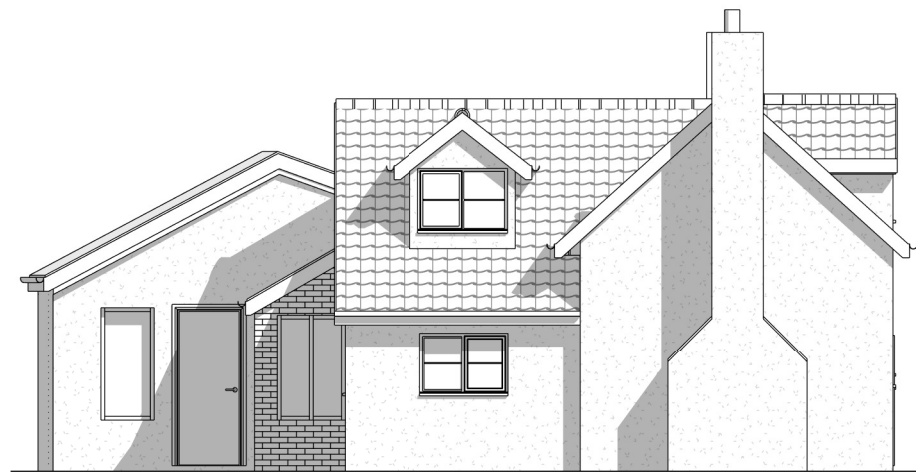
Proposed North West Elevation 1 : 100