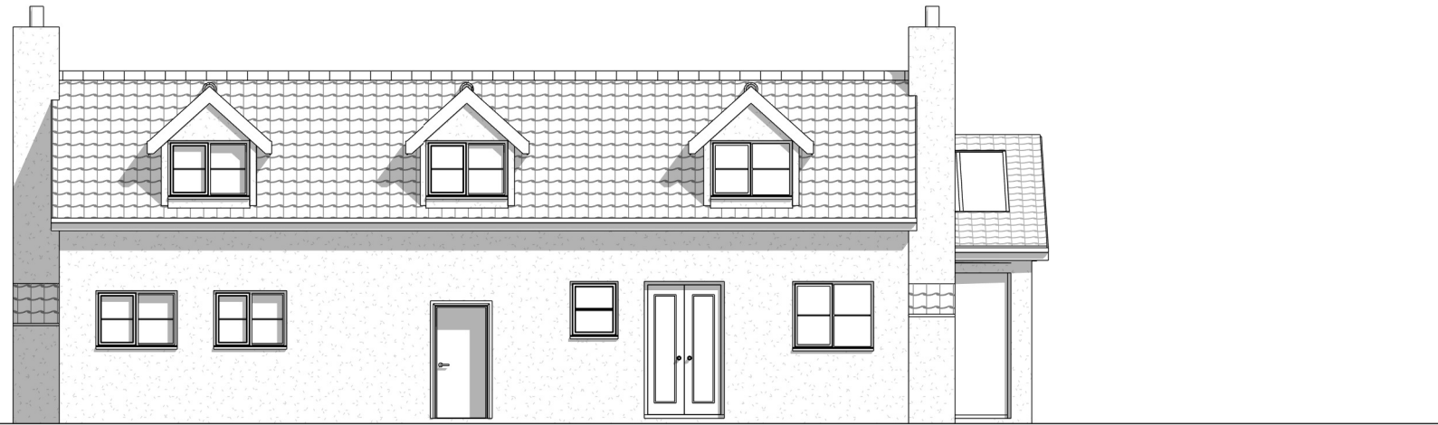
Proposed South West Elevation 1 : 100