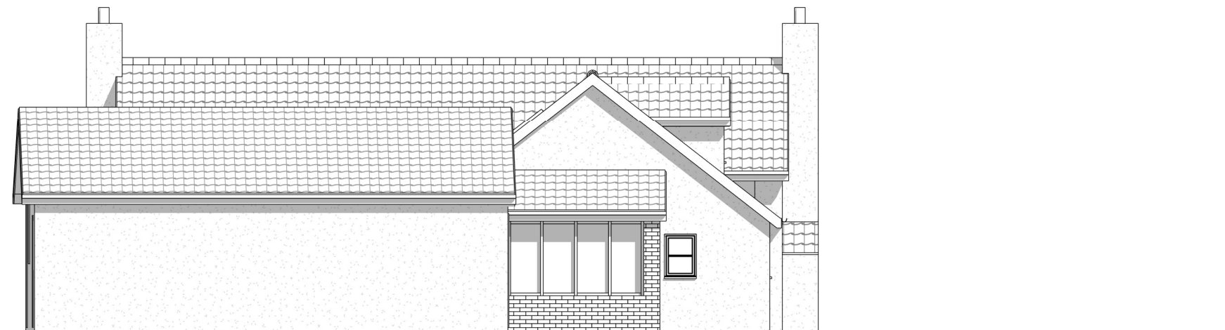
Proposed North East Elevation 1 : 100