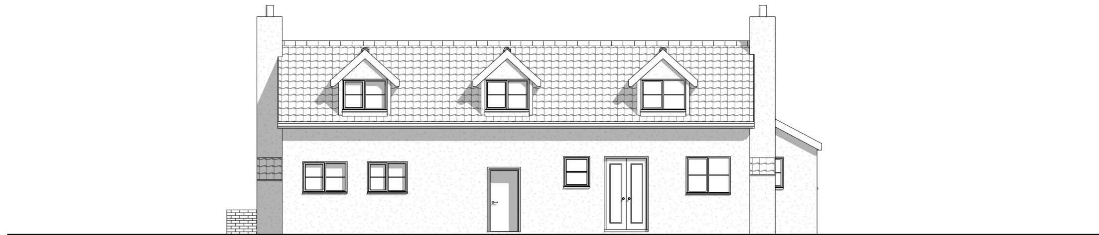
South West 1:100