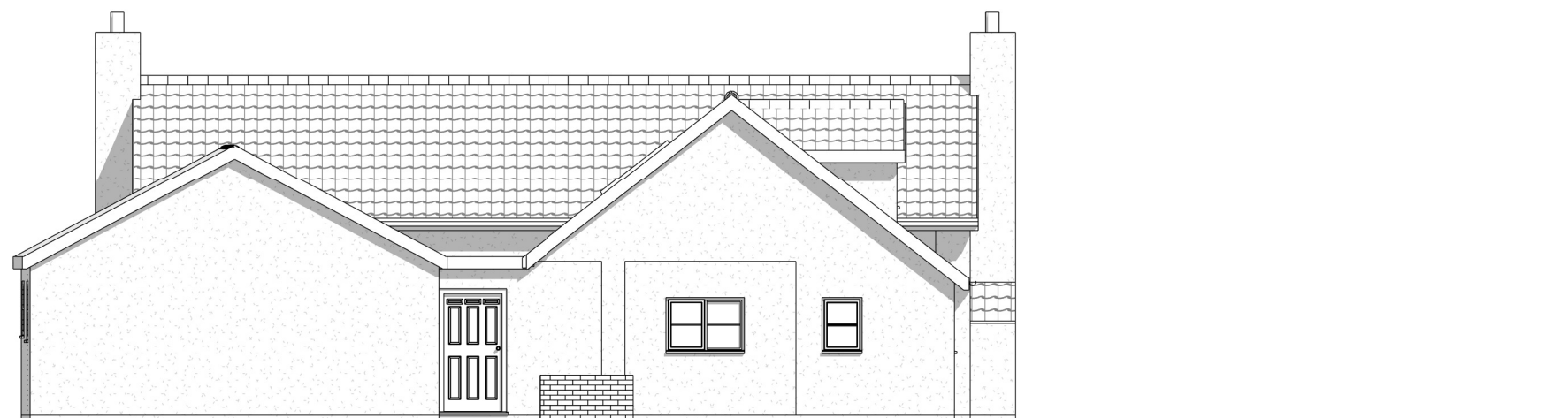
North East 1:100