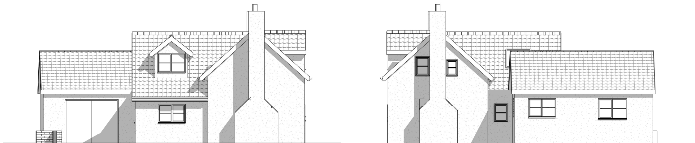
North West 1:100