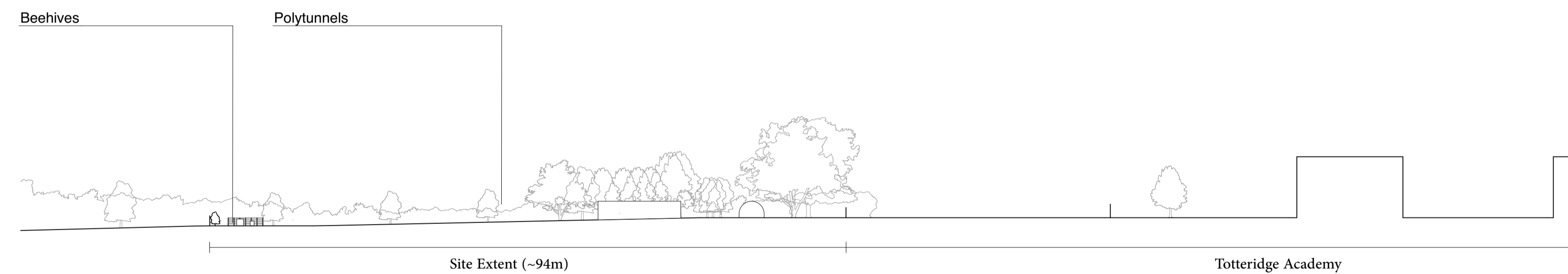
Proposed Section CC 1:500@A1