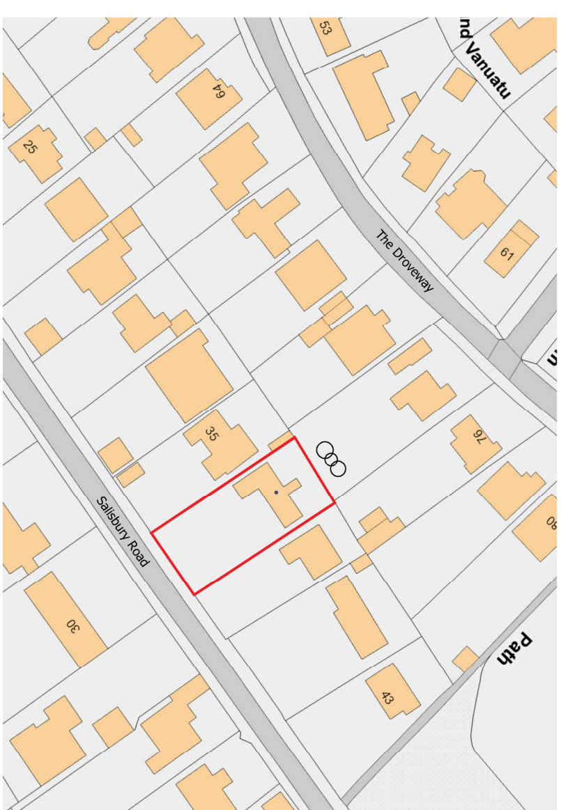
Location Plan 1:1250 (A3)