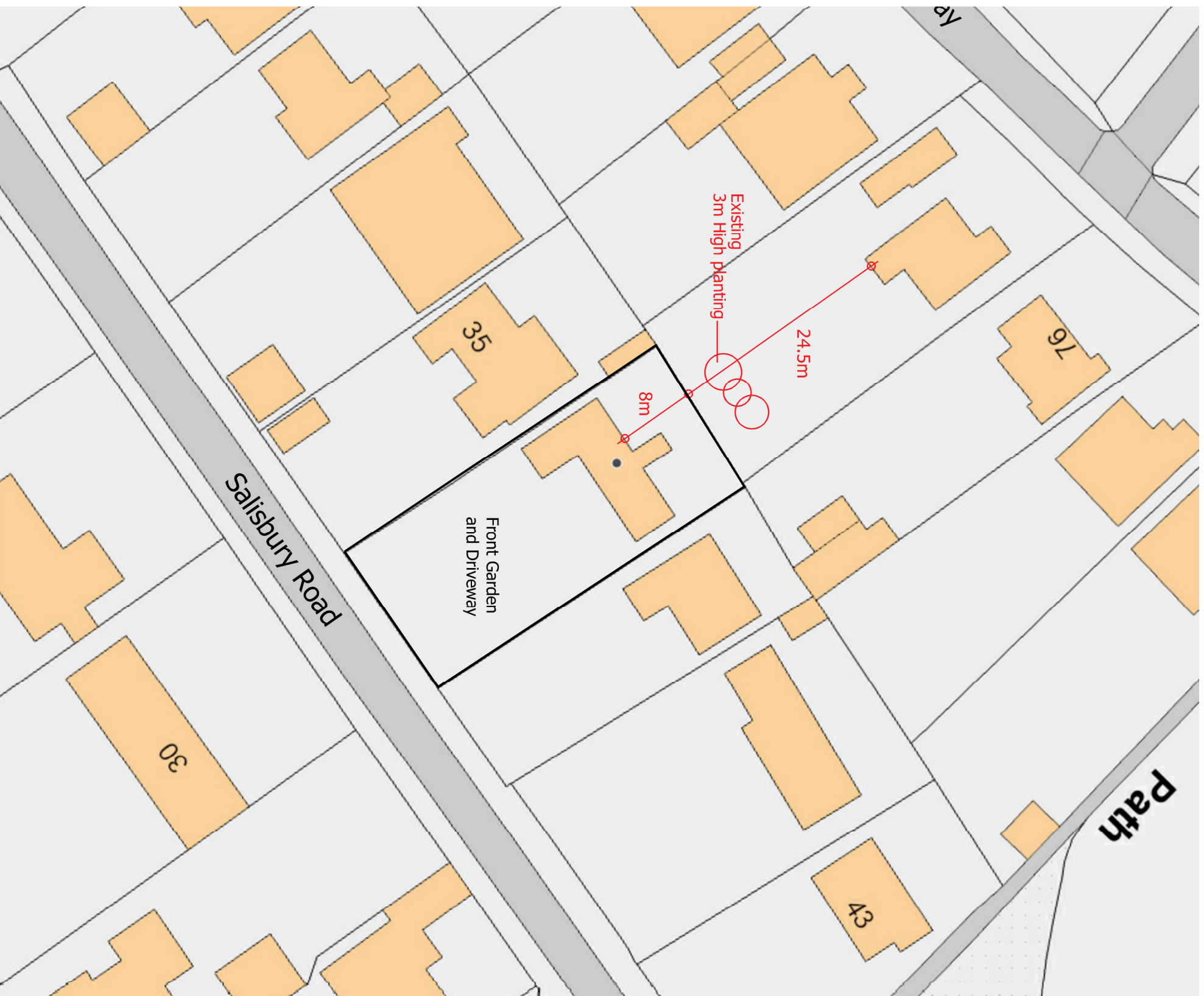
Site Plan 1:500 (A3)