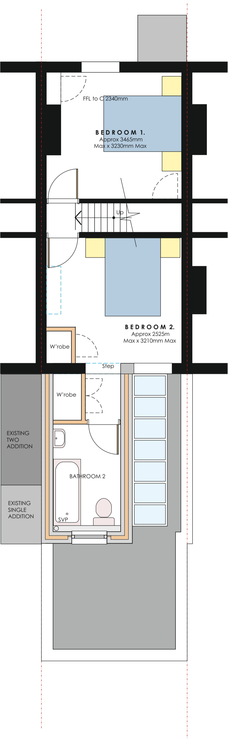
Proposed First Floor Plan-1:50