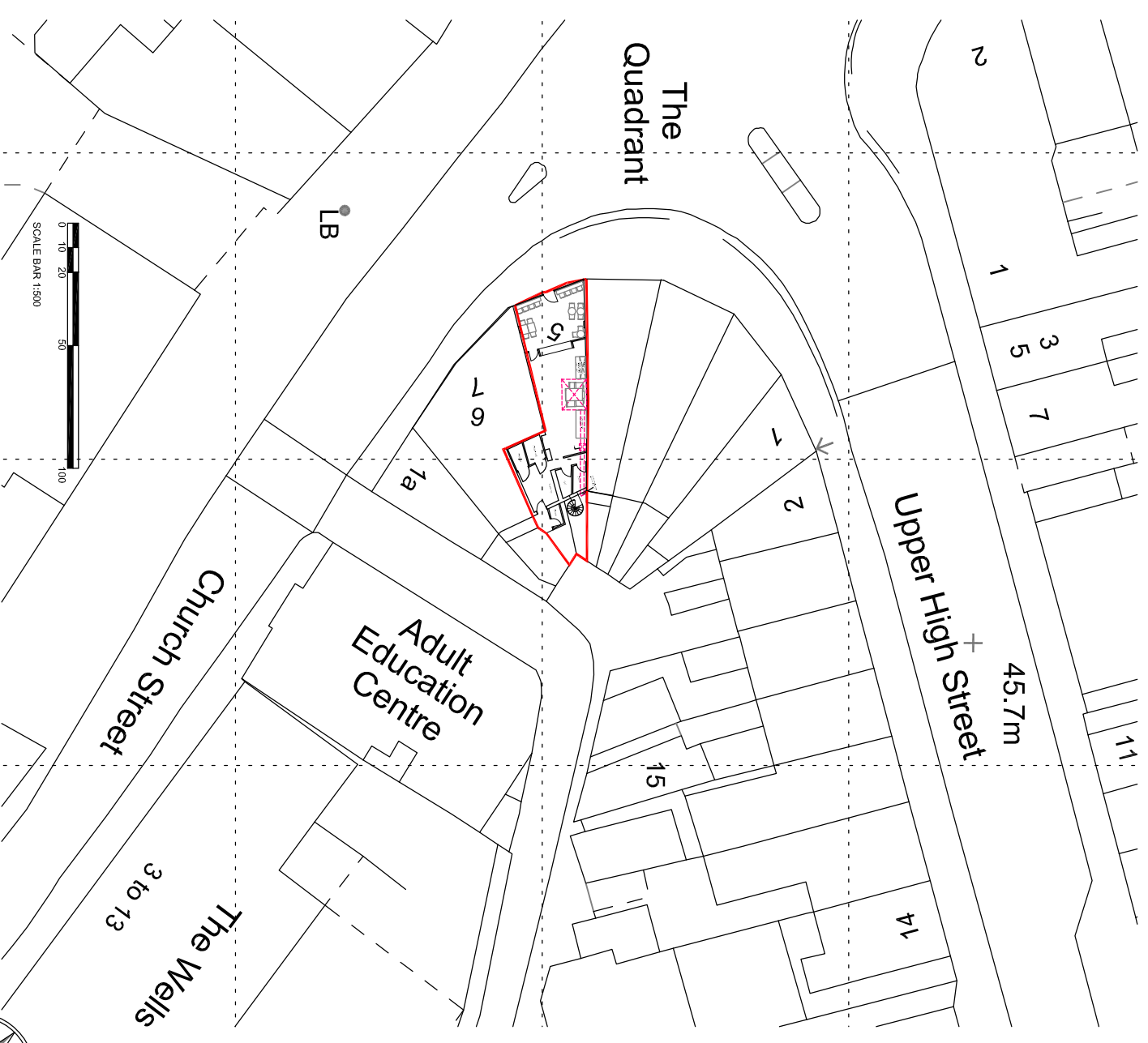
BLOCK PLAN @ 1:500