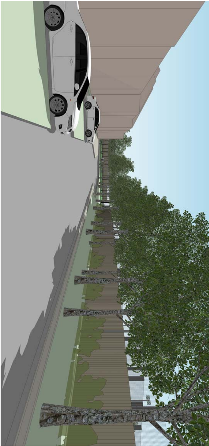
View Along Robinson Road Showing the Acoustic Fence