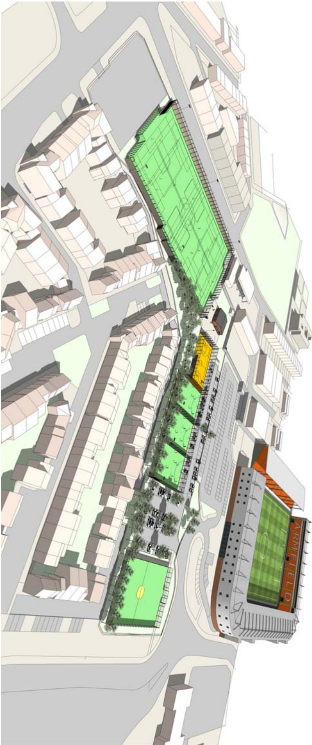
Aerial View Looking from North West