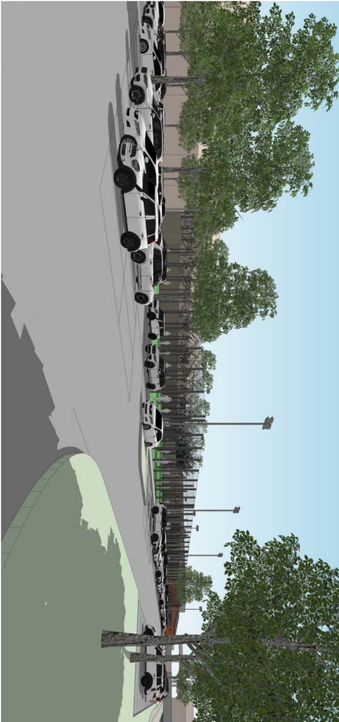
View from Entrance