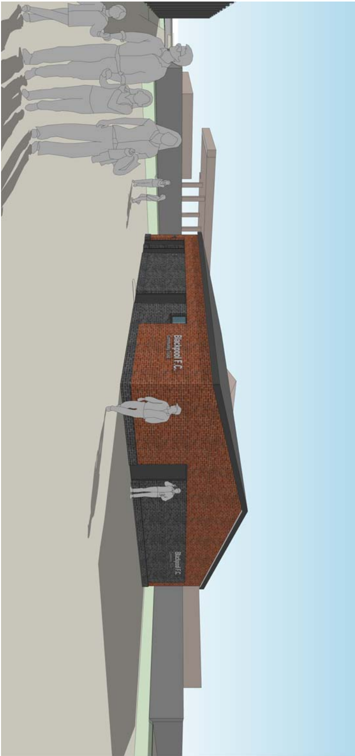
View of the Pavilion Looking from the North West