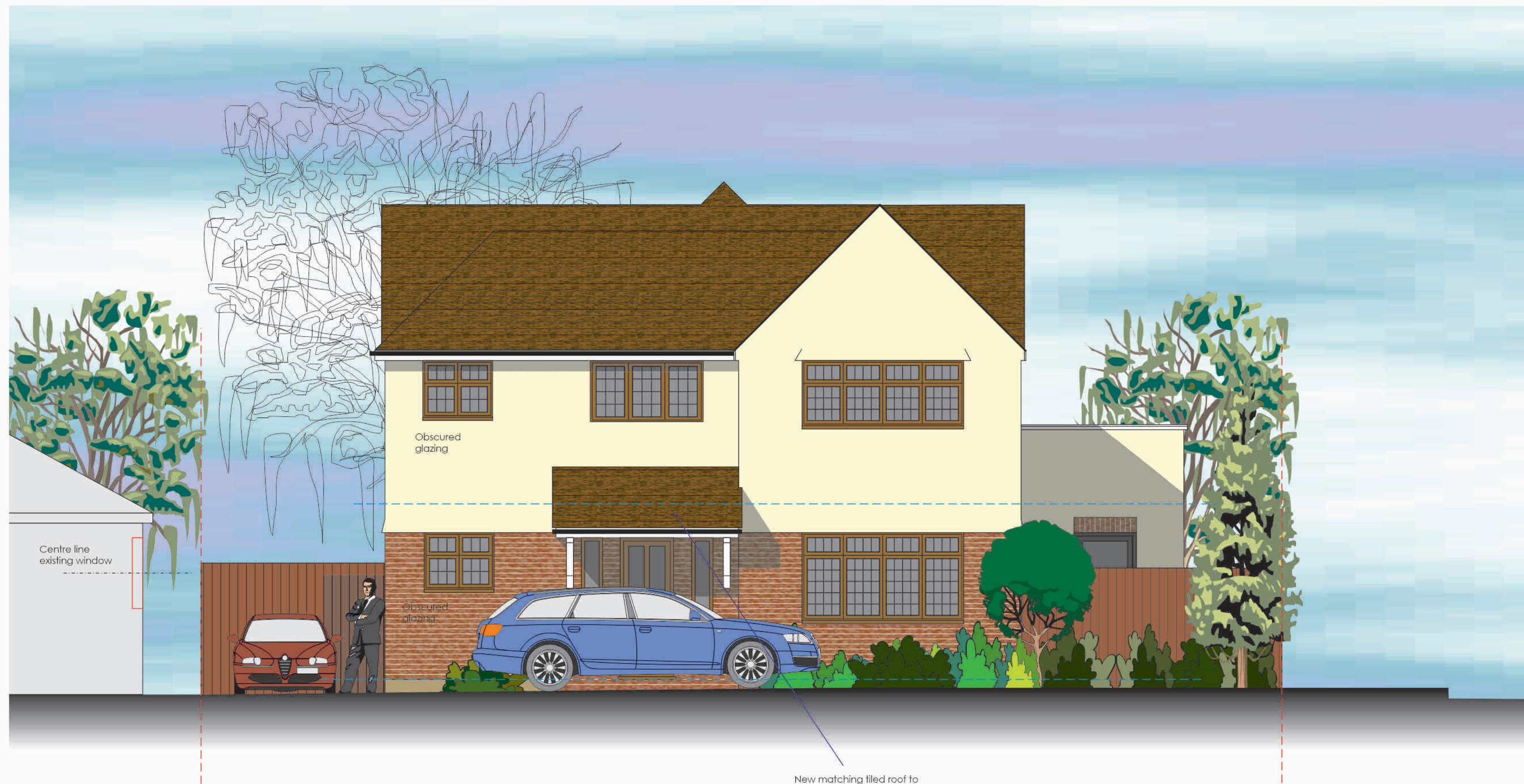
Proposed Front Elevation - 1:50 WEST