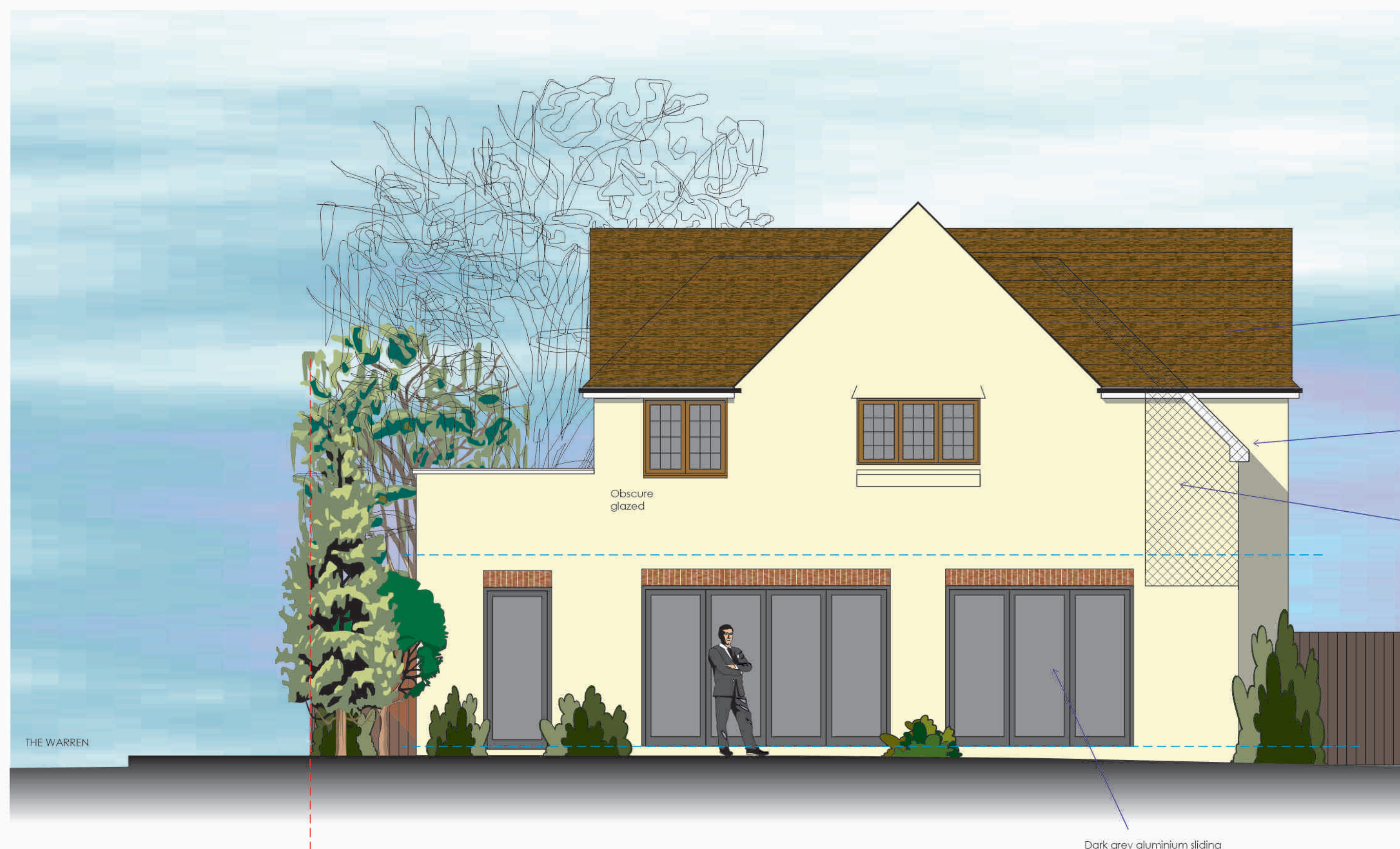
Proposed Rear Elevation - 1:50 EAST