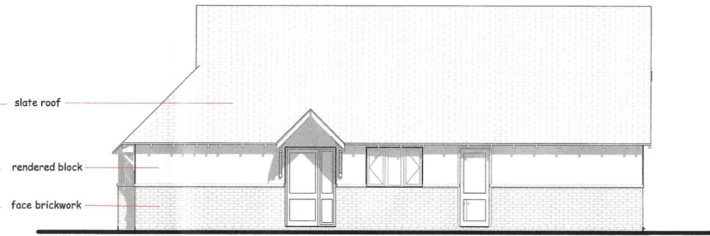
SIDE (W) ELEVATION