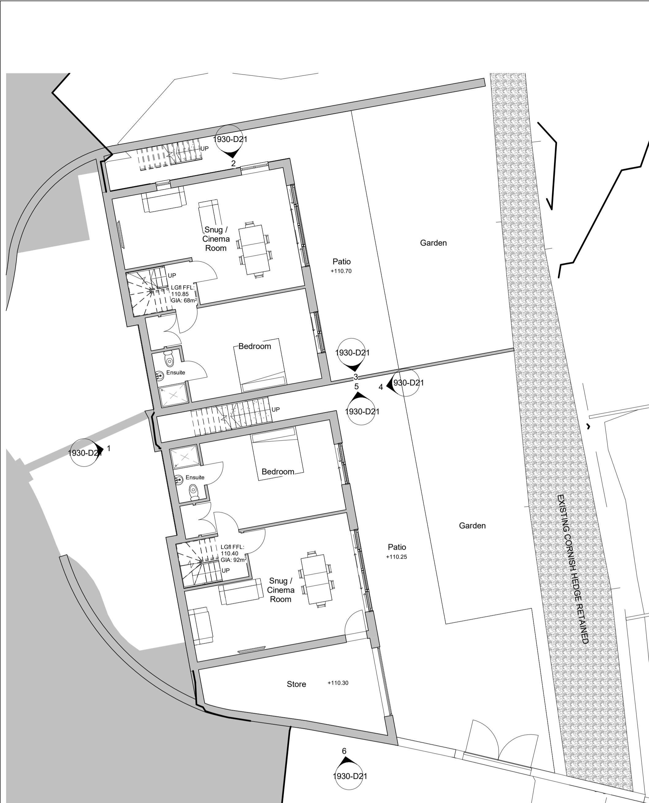
1 LGfl Plan - Plots 17 & 18 1 : 100