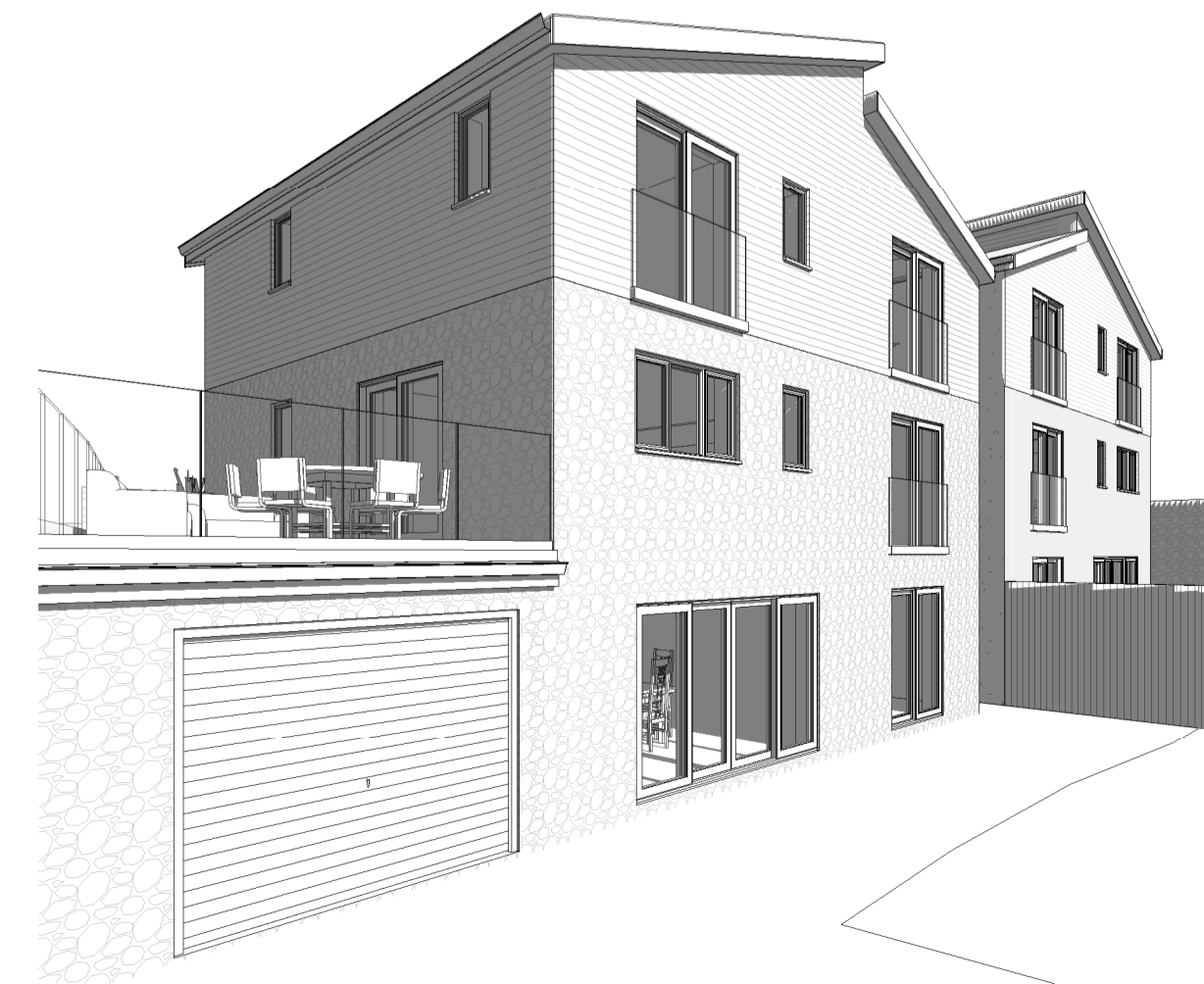
6 3D View 3-Plot 18