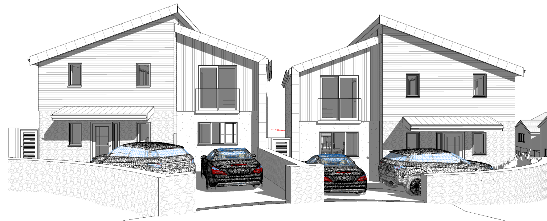
5 3D View 2-Plots 17 & 18