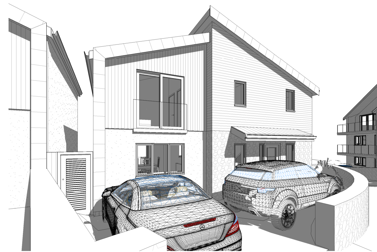
4 3D View 1-Plot 18