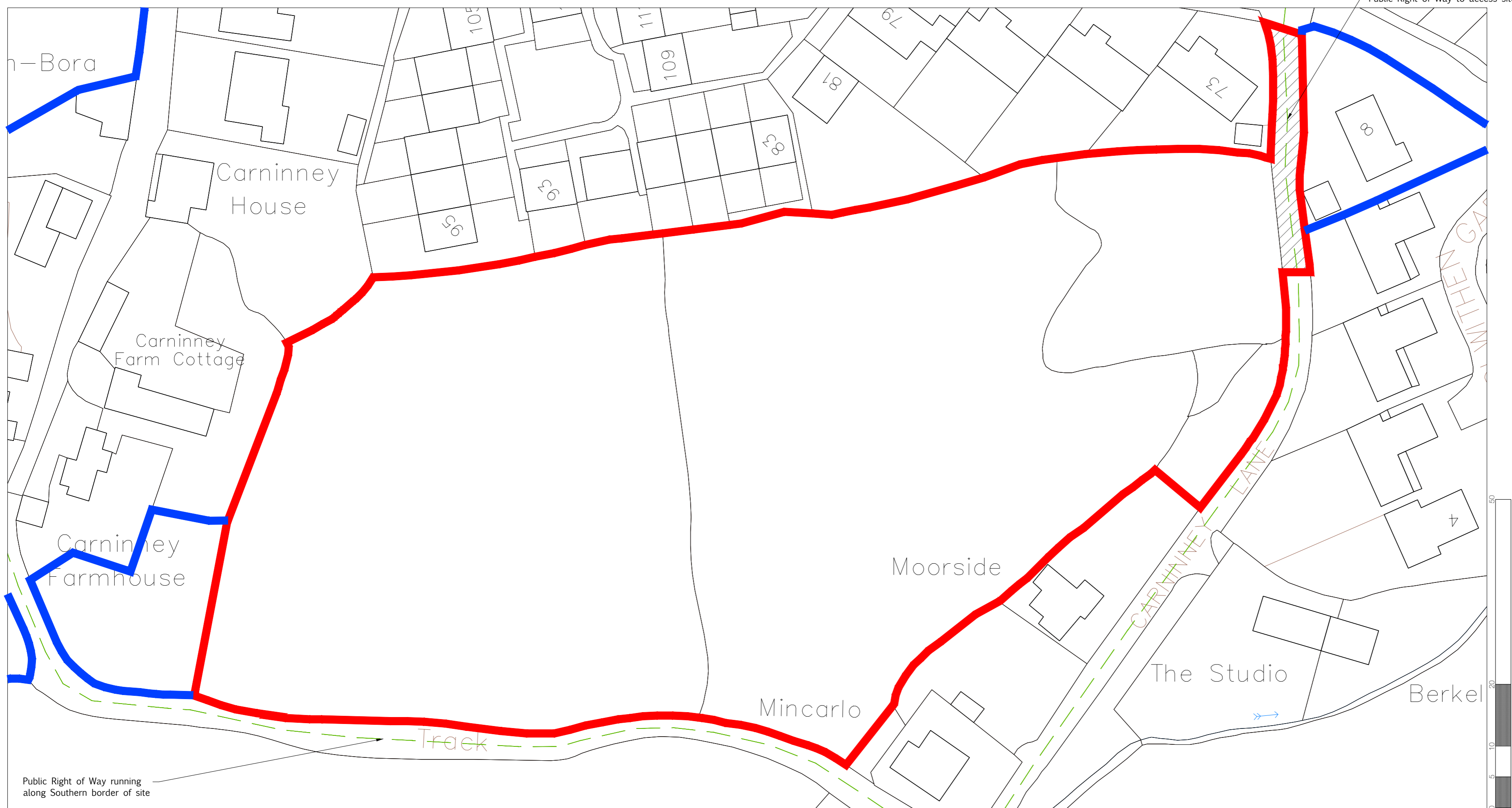
BLOCK PLAN @ 1:500