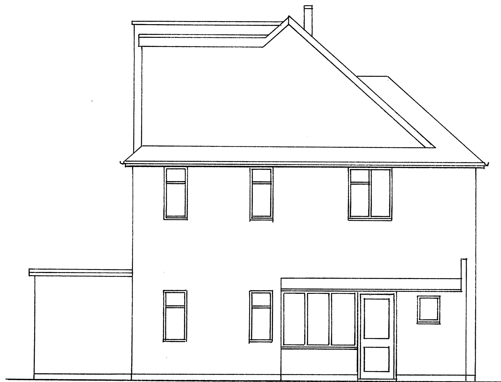
EXISTING SIDE ELEVATION (EAST) 1:50 AT A1

All work to comply with building regulations and planning consent. Workmanship and materials to comply with British standards and code of practice. Scaled dimensions are approximate, take exact dimensions from site. This drawing was prepared for local authority approval and not as a working drawing. LOCAL AUTHORITY MAY SCALE THE DRAWING Any deviation from the drawing to be agreed with the local authority. Any queries to be agreed prior to construction. See separate details for Structural engineers calculations.