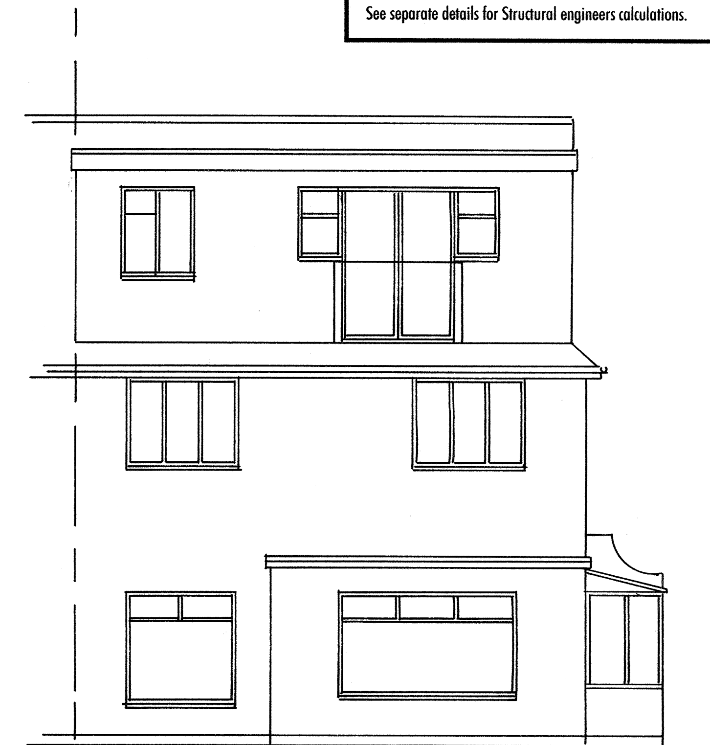
EXISTING REAR ELEVATION (SOUTH) 1:50 AT A1