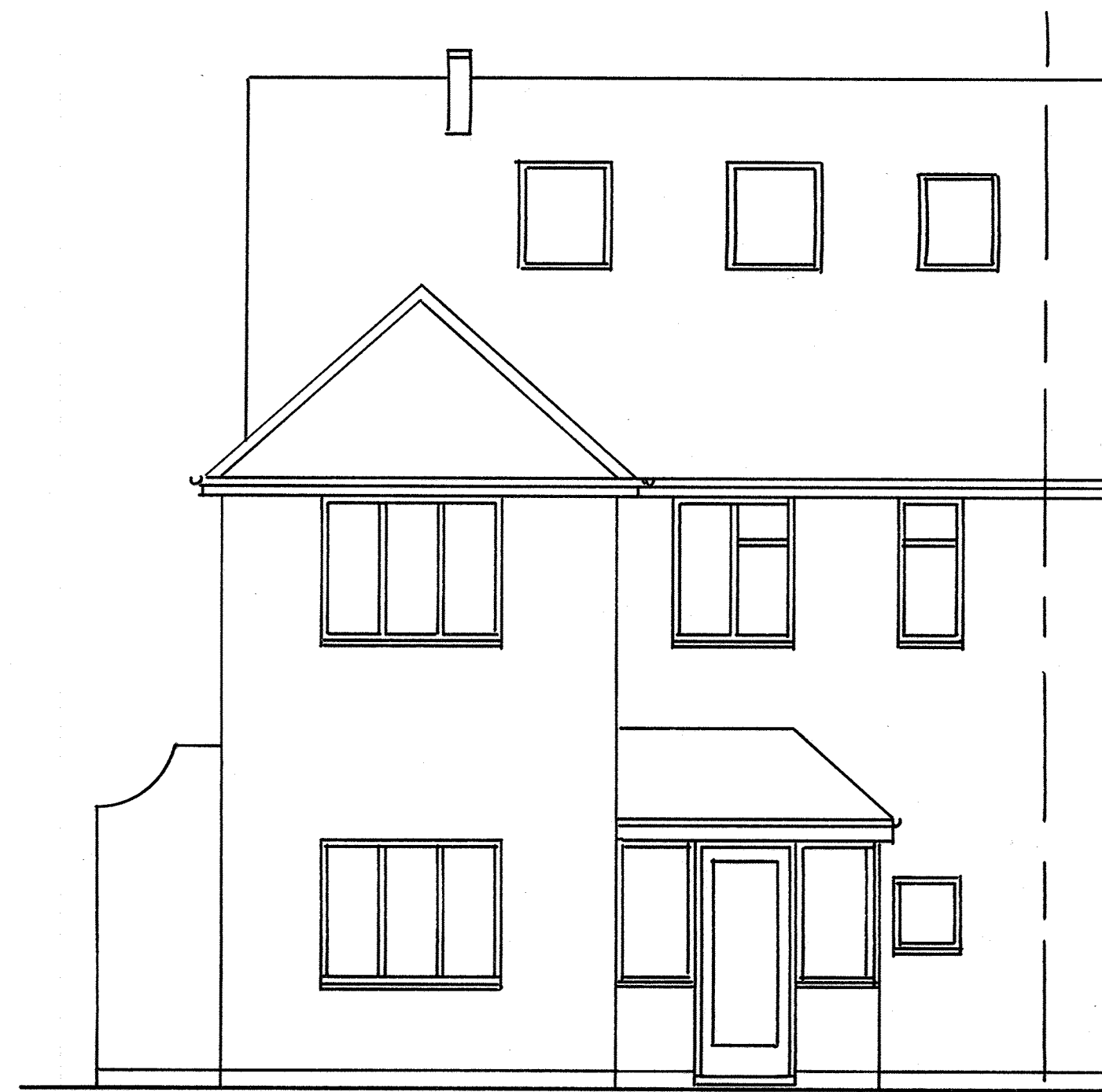
EXISTING FRONT ELEVATION (NORTH) 1:50 AT A1