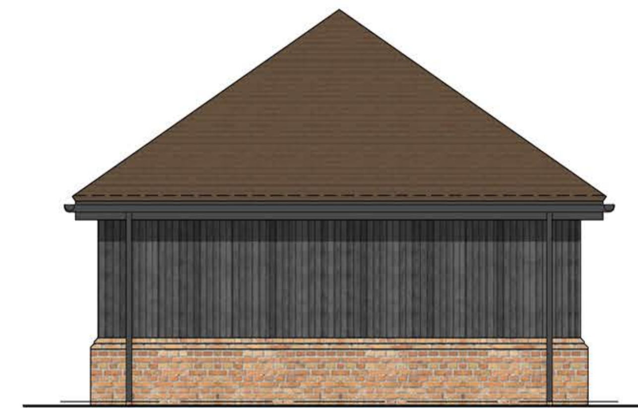
Proposed Side Elevation Scale 1:50