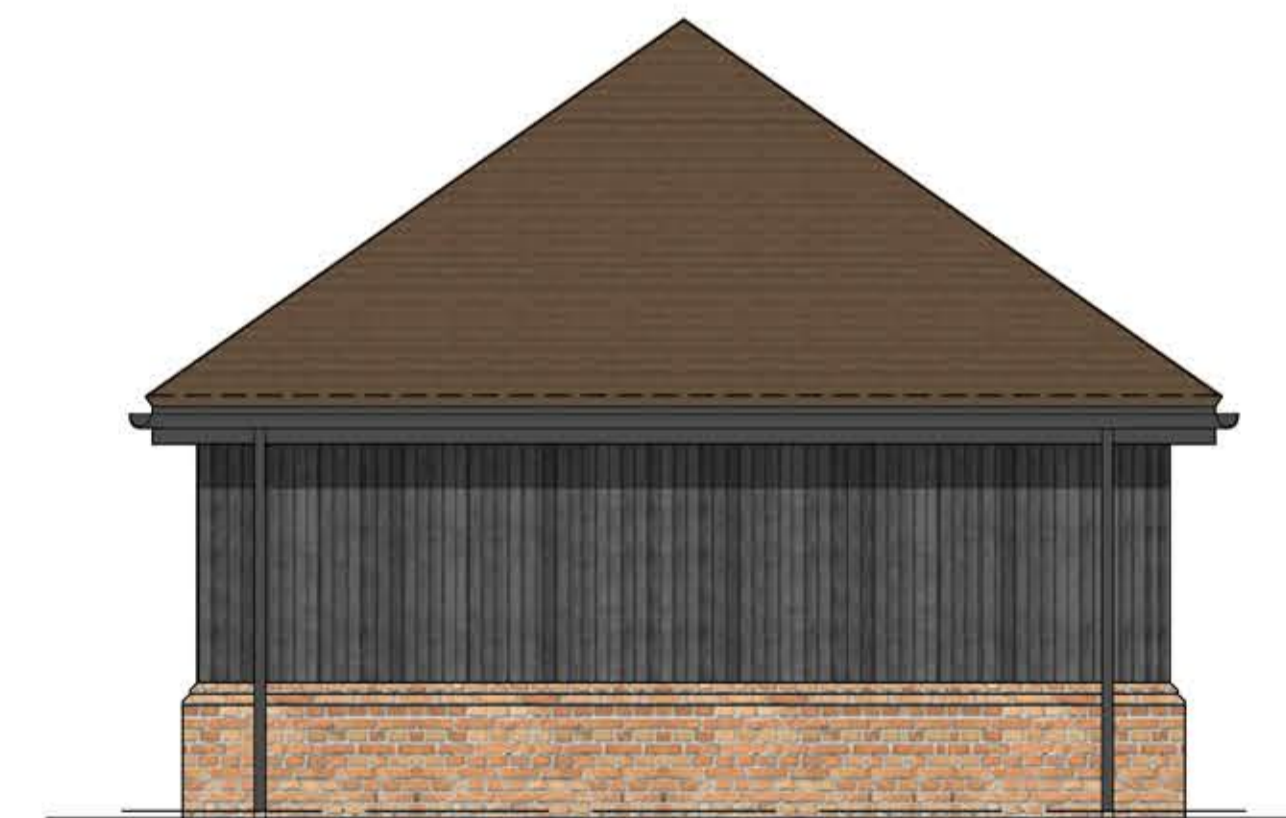
Proposed Side Elevation Scale 1:50