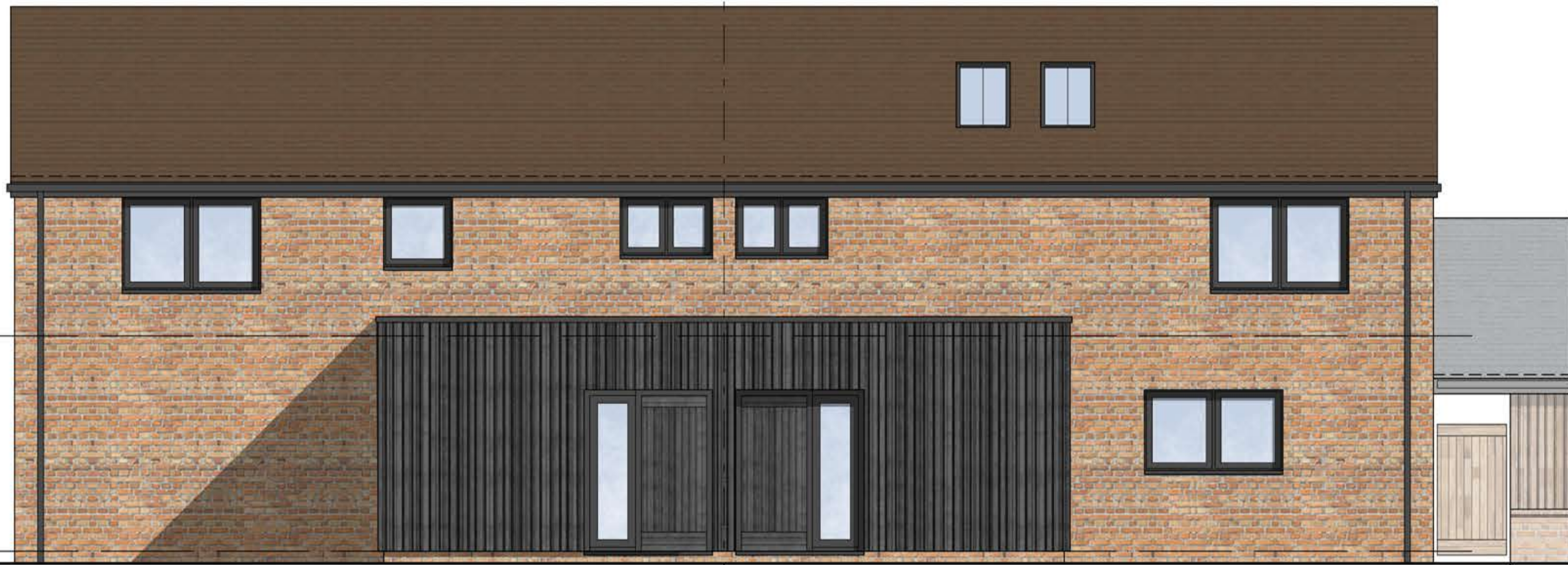
Proposed Front Elevation Scale 1:50