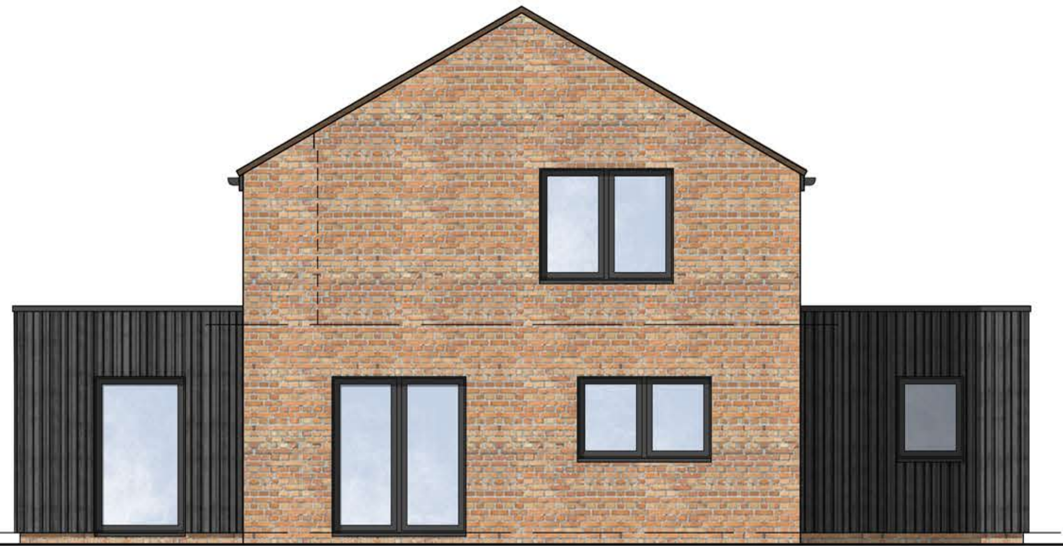
Proposed Side Elevation Scale 1:50