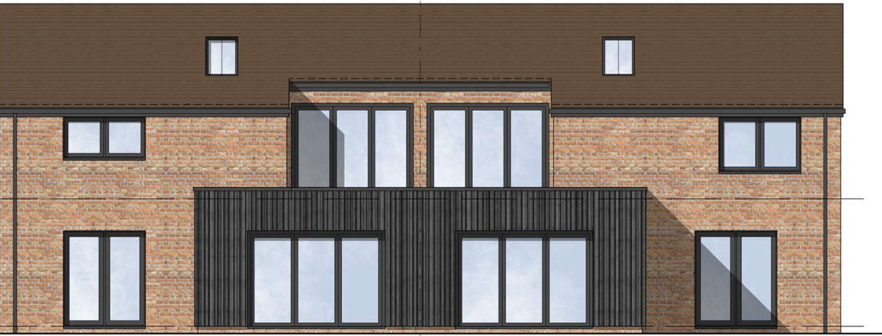
Proposed Rear Elevation Scale 1:50