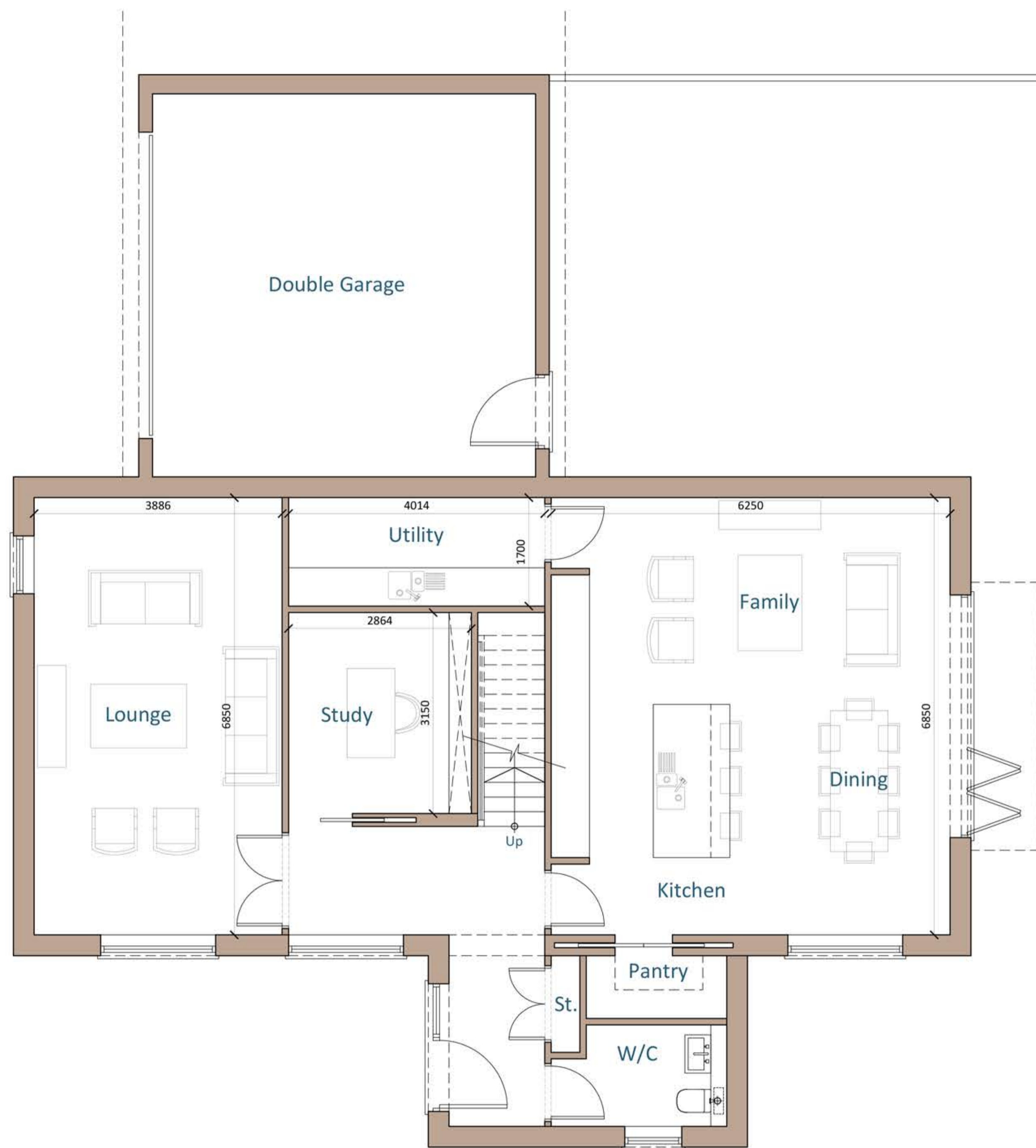
Proposed Ground Floor Plan Scale 1:50