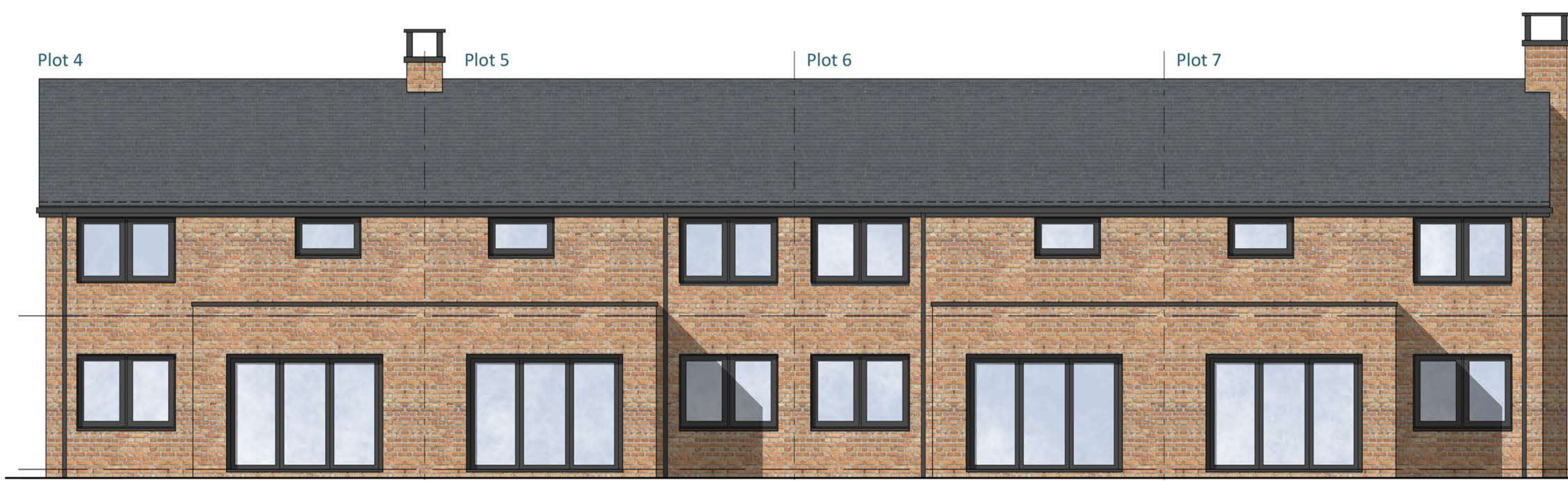
Proposed Rear Elevation Scale 1:50