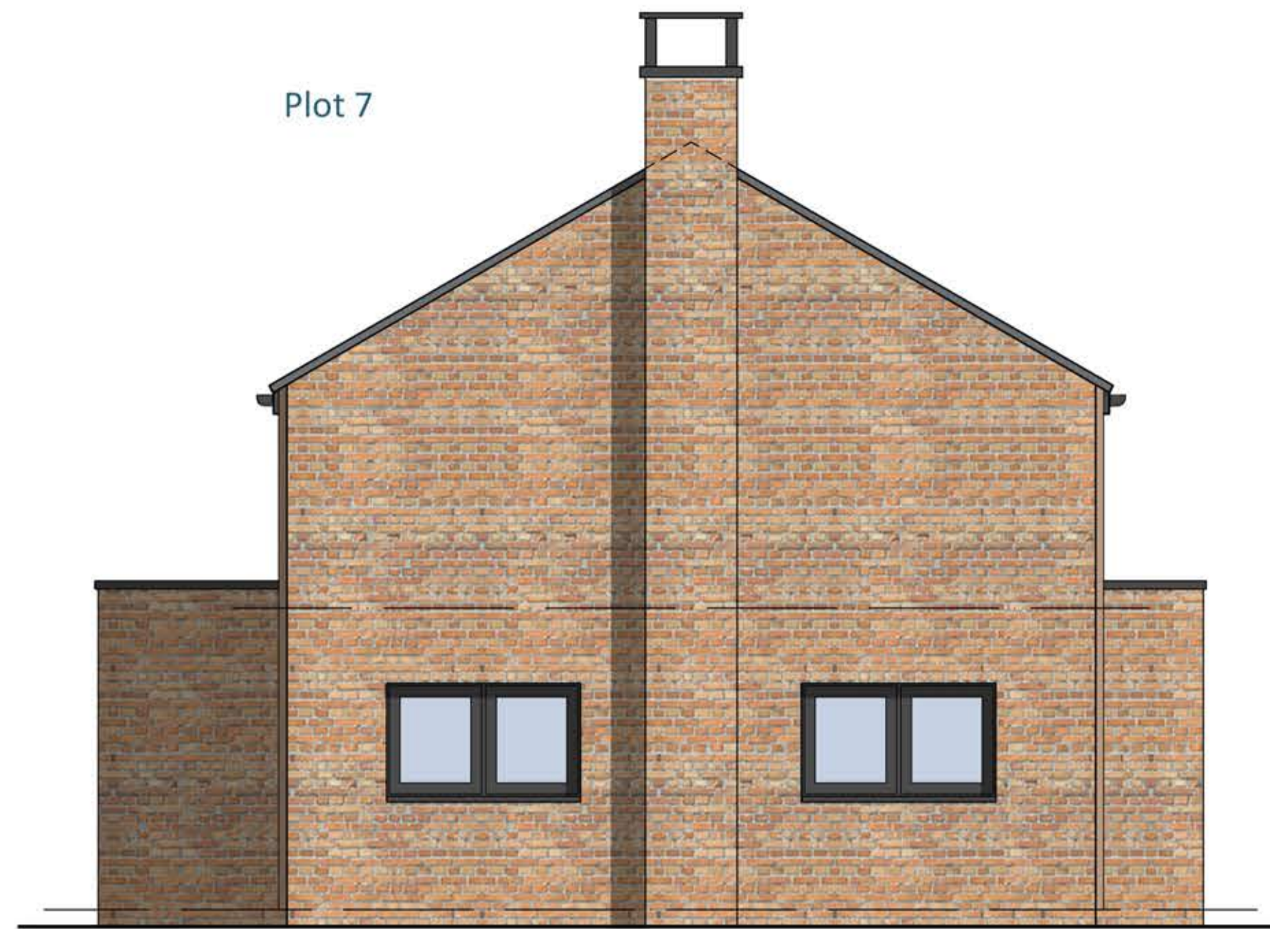
Proposed Side Elevation Scale 1:50