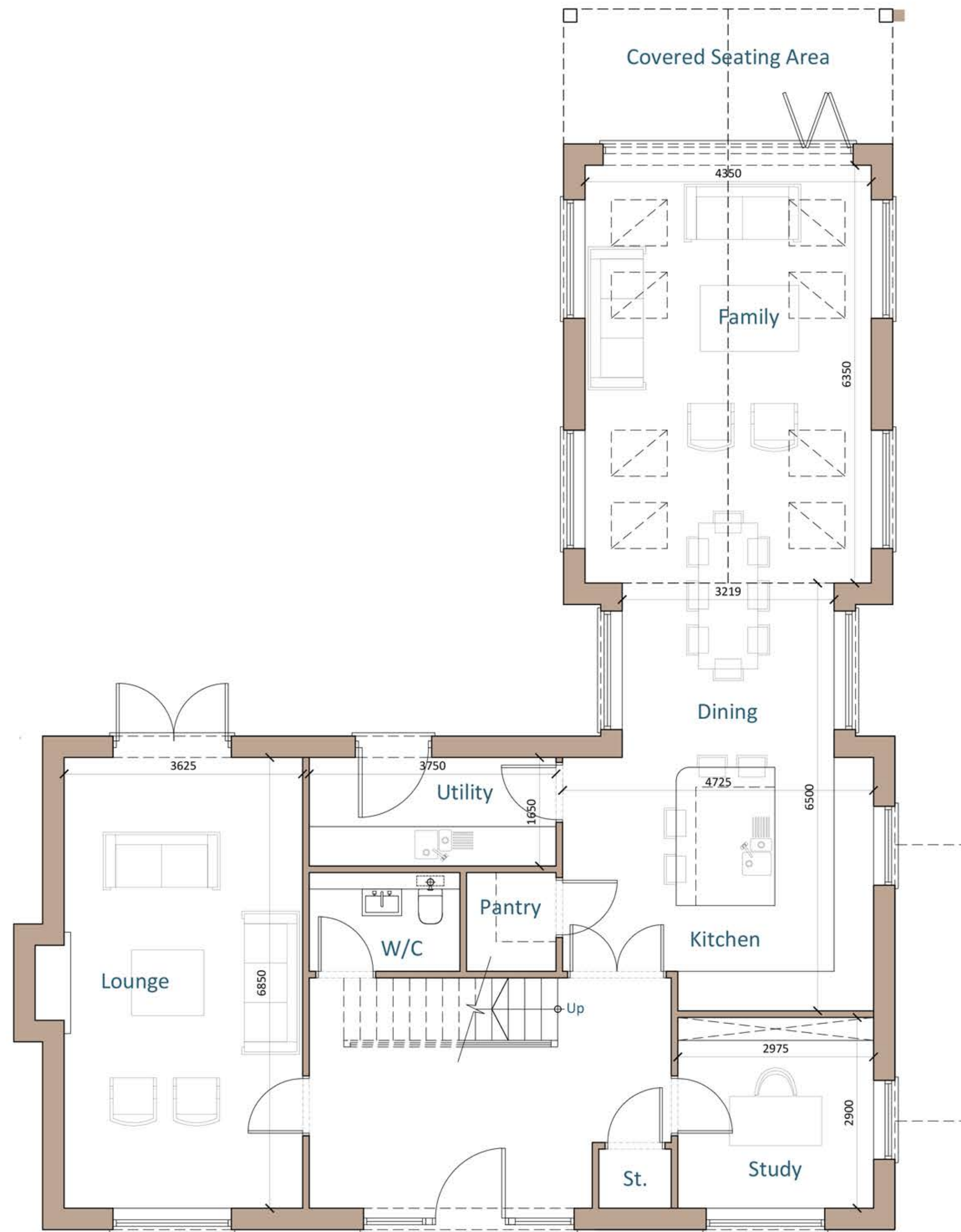
Proposed Ground Floor Plan Scale 1:50