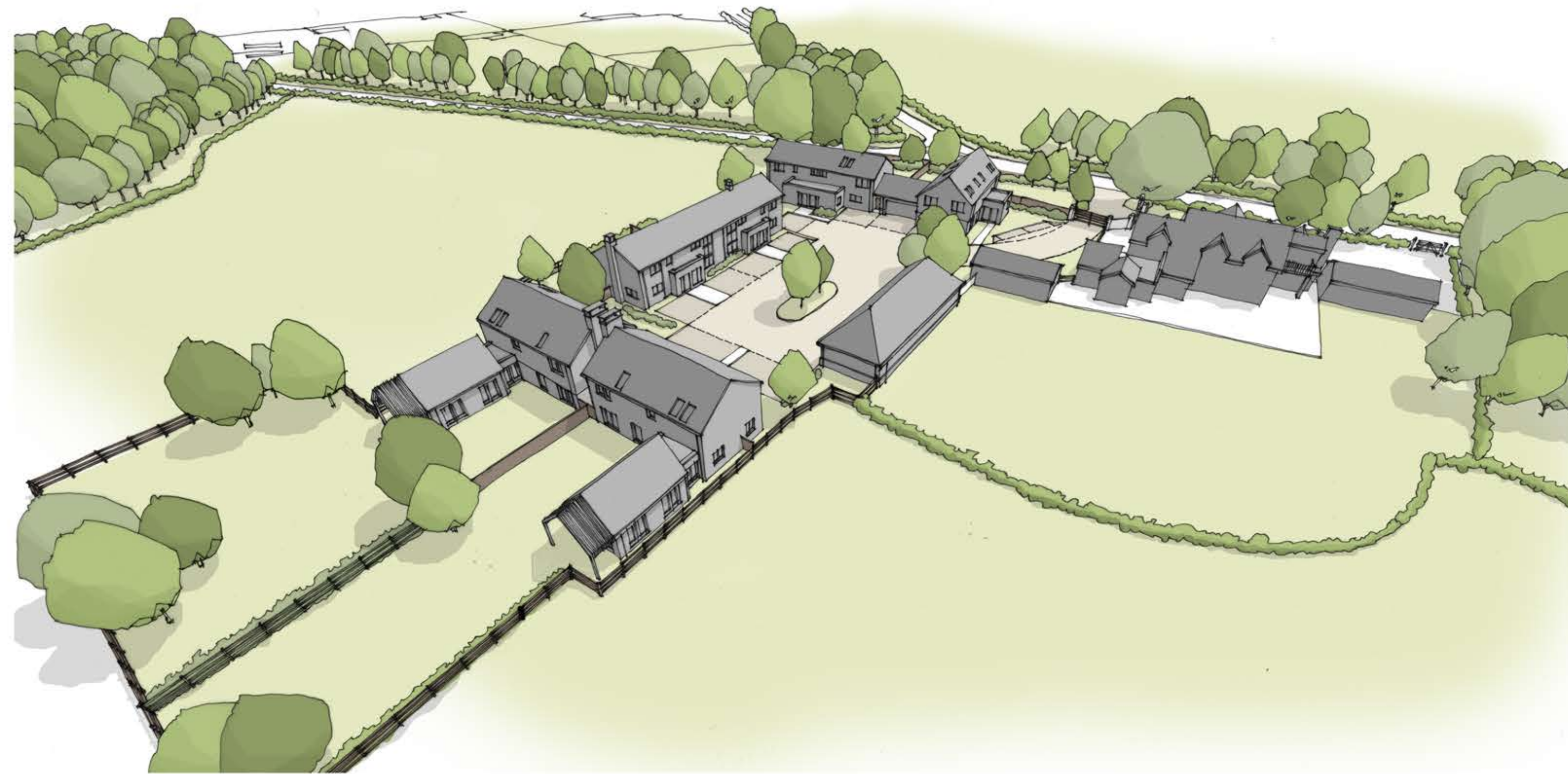
Proposed Visual [Massing] NTS