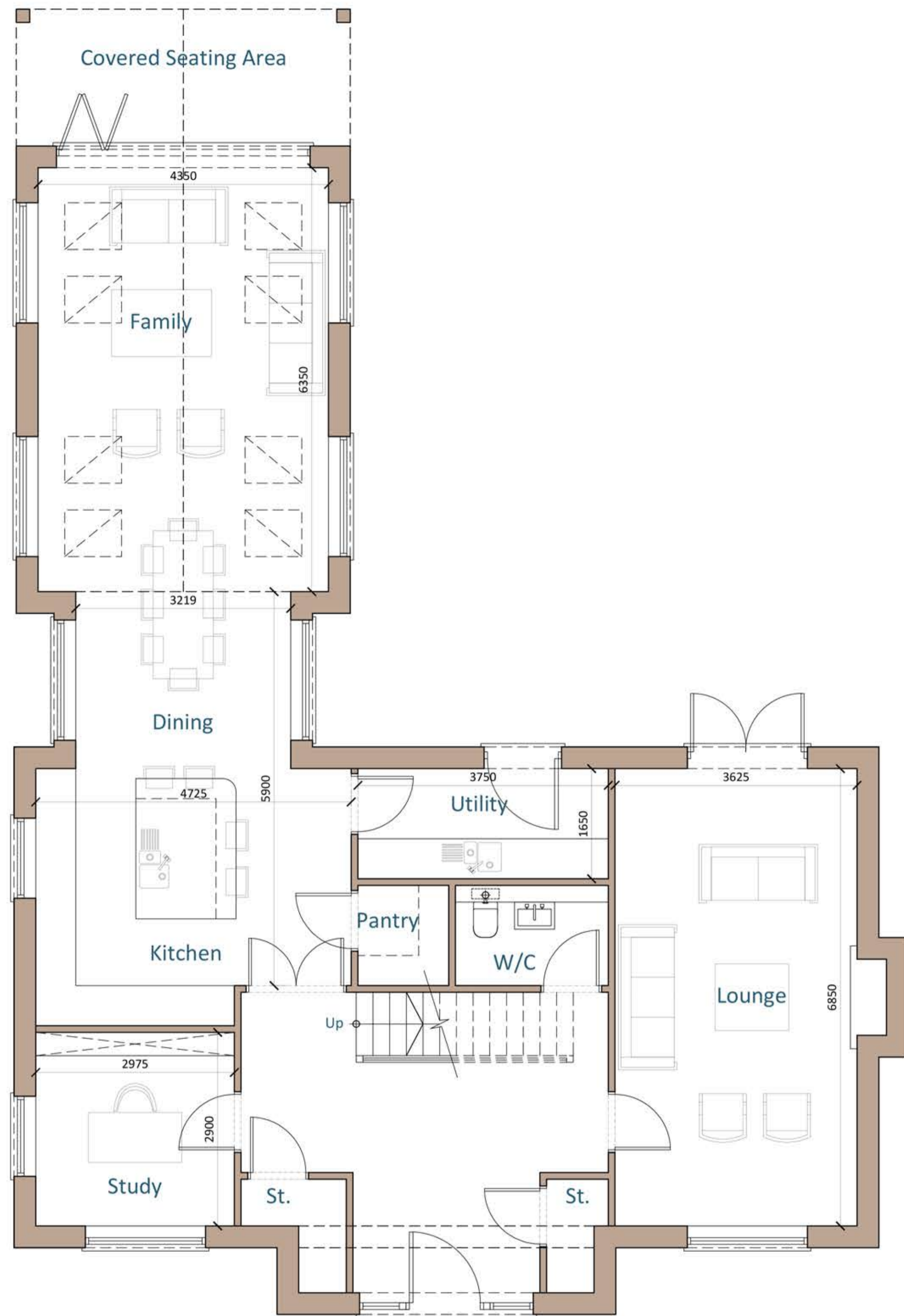
Proposed Ground Floor Plan Scale 1:50