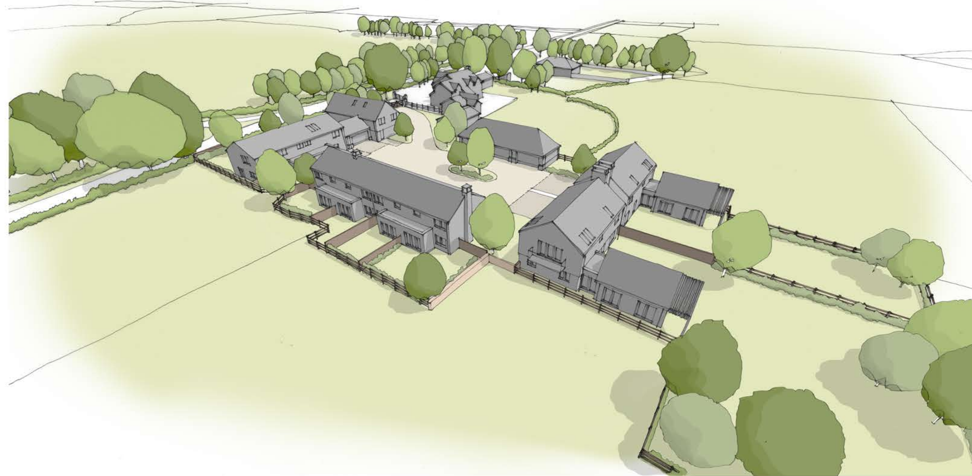
Proposed Visual [Massing] NTS