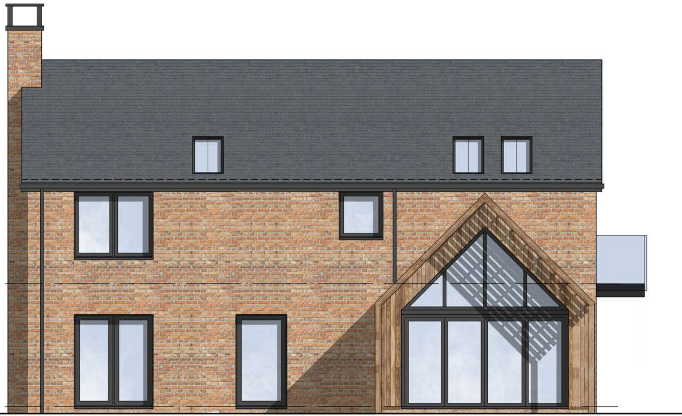
Proposed Rear Elevation Scale 1:50