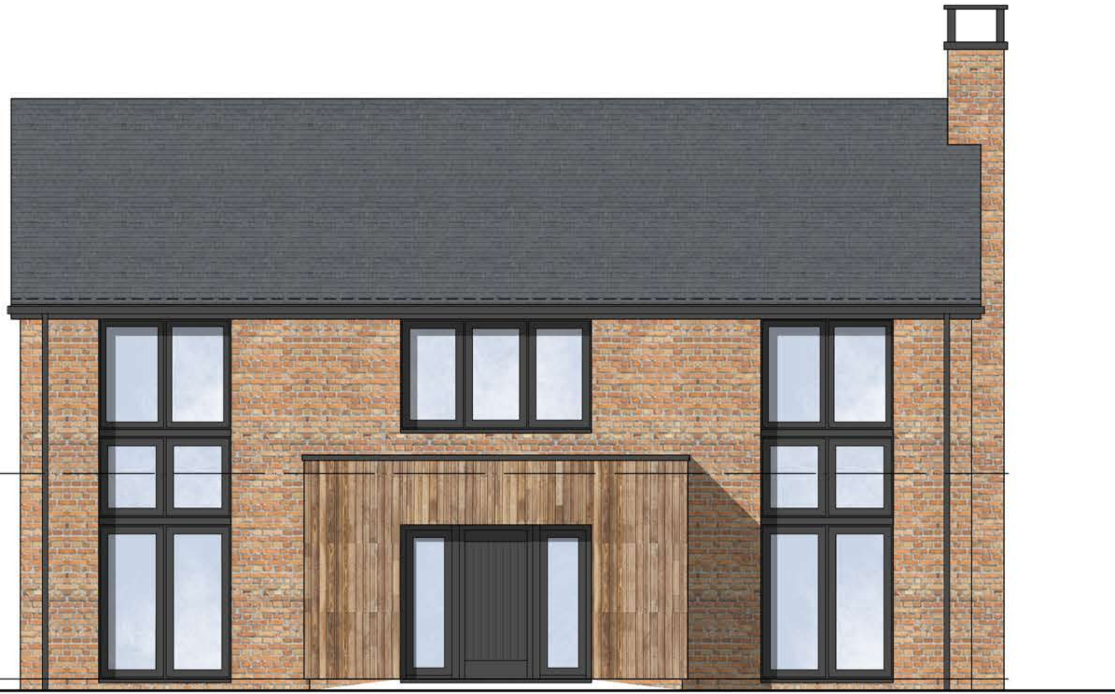
Proposed Front Elevation Scale 1:50