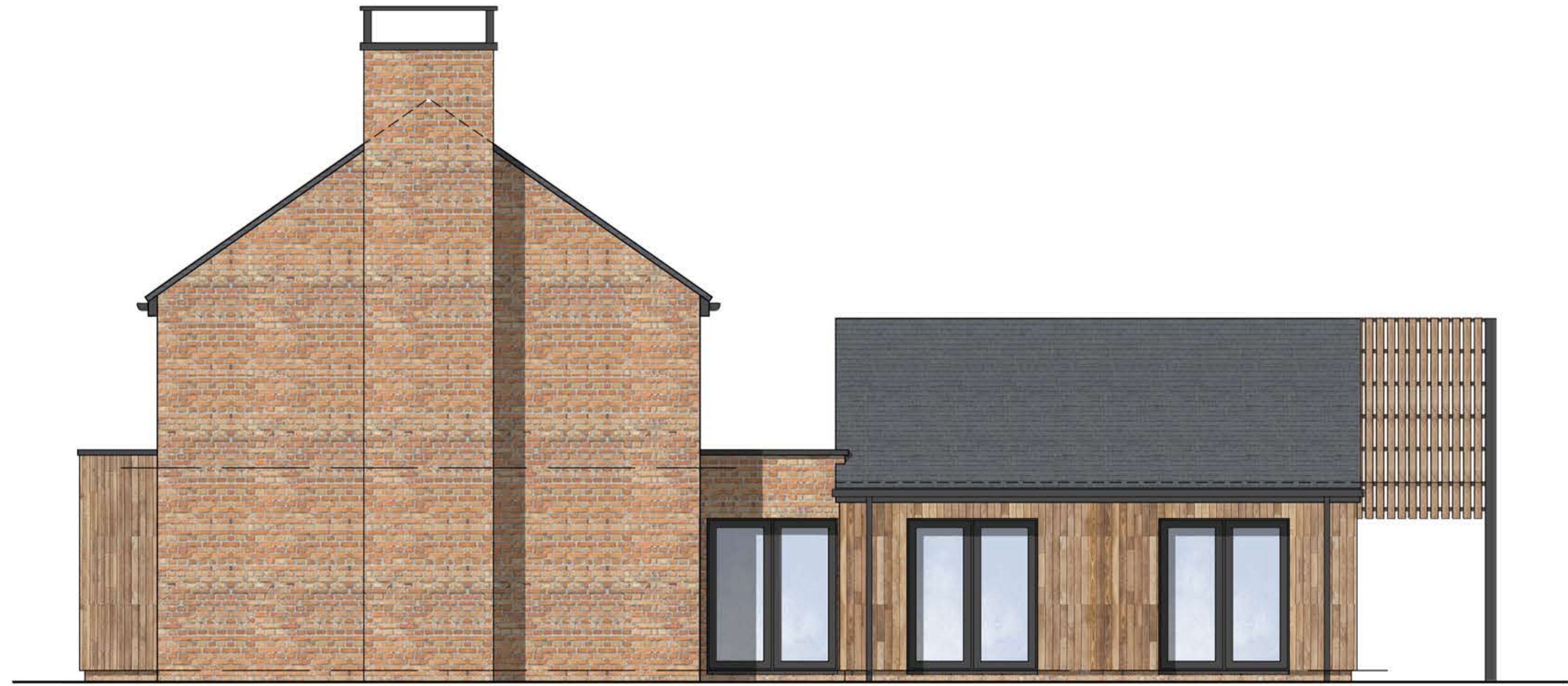
Proposed Side Elevation Scale 1:50