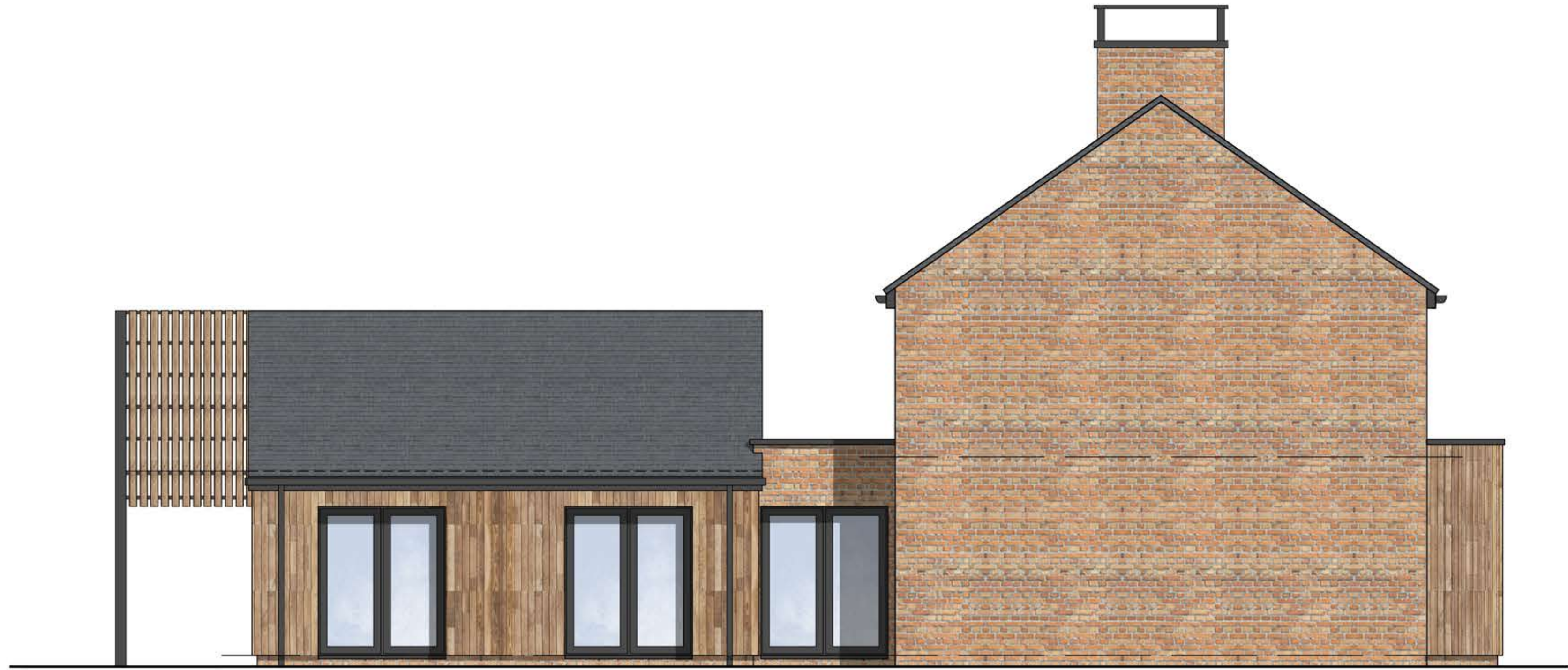
Proposed Side Elevation Scale 1:50