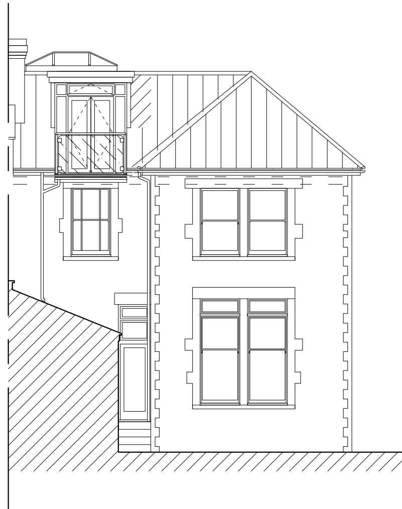
S.W. (REAR) ELEVATION