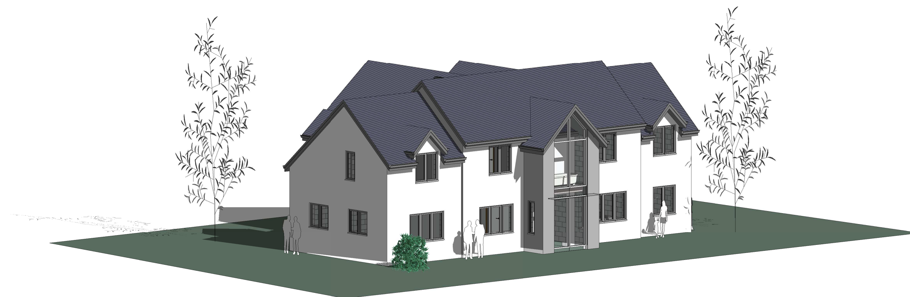
5 3D View