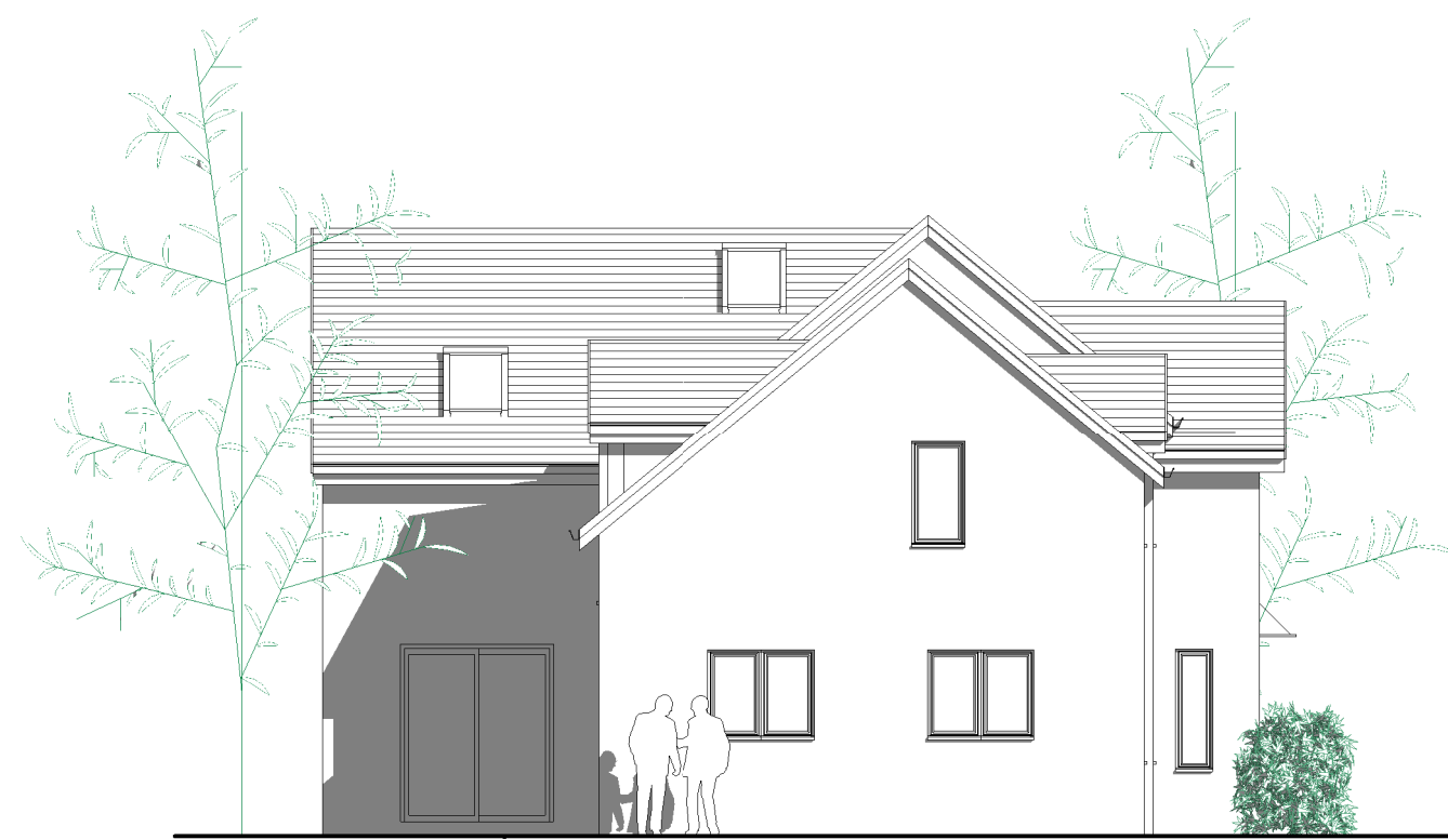
3 Side Elevation 1 1 : 100