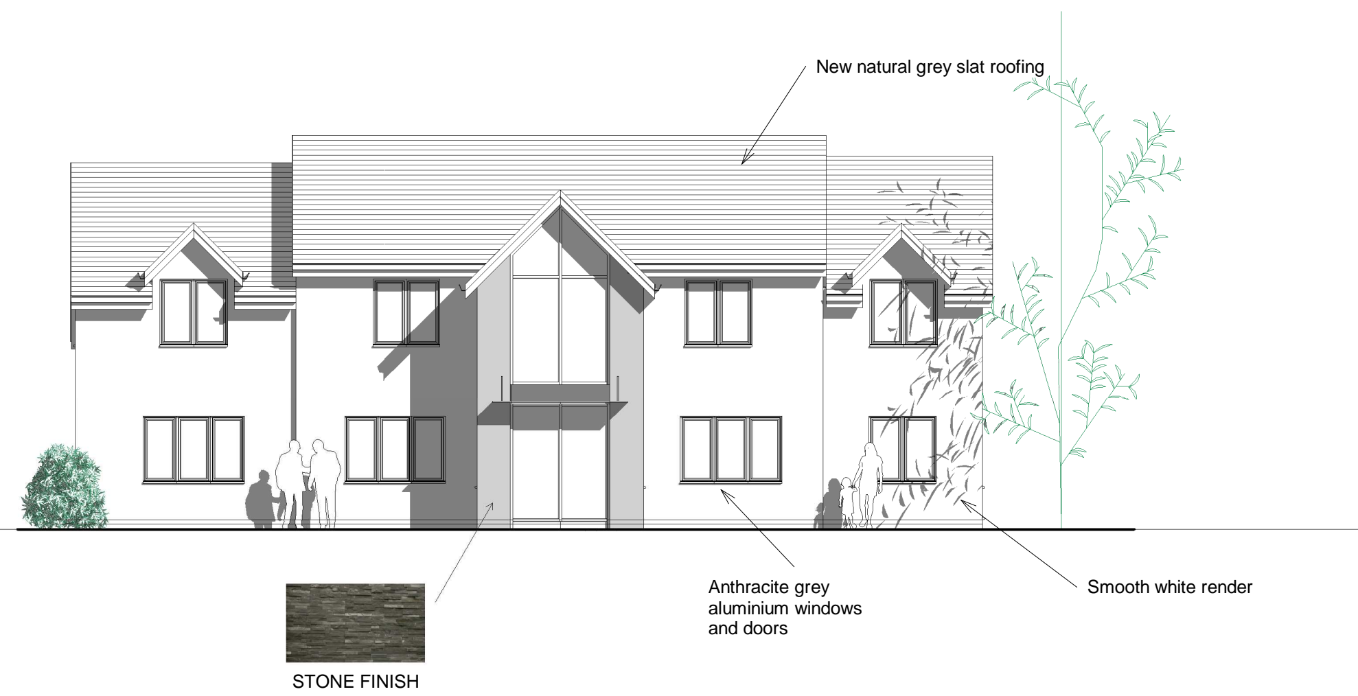
1 Front Elevation 1 : 100

It is assumed that all works on this drawing will be carried out by a competent contractor working, where appropriate, to an approved method statement.