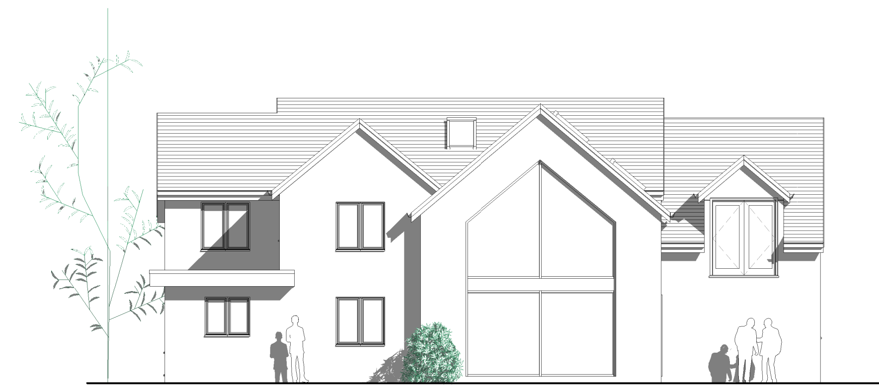
2 Rear Elevation 1 : 100