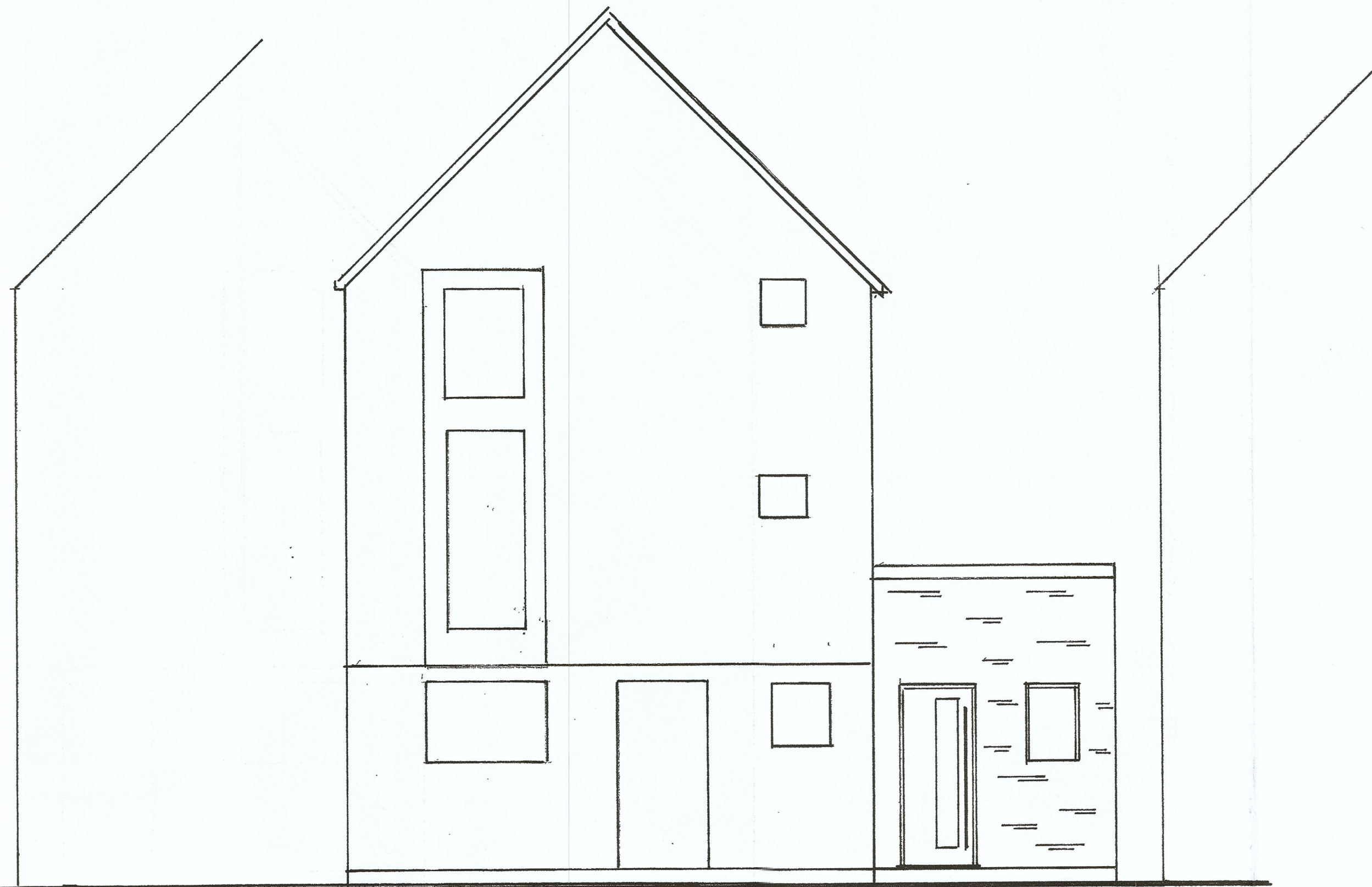
PROPOSED FRONT ELEV