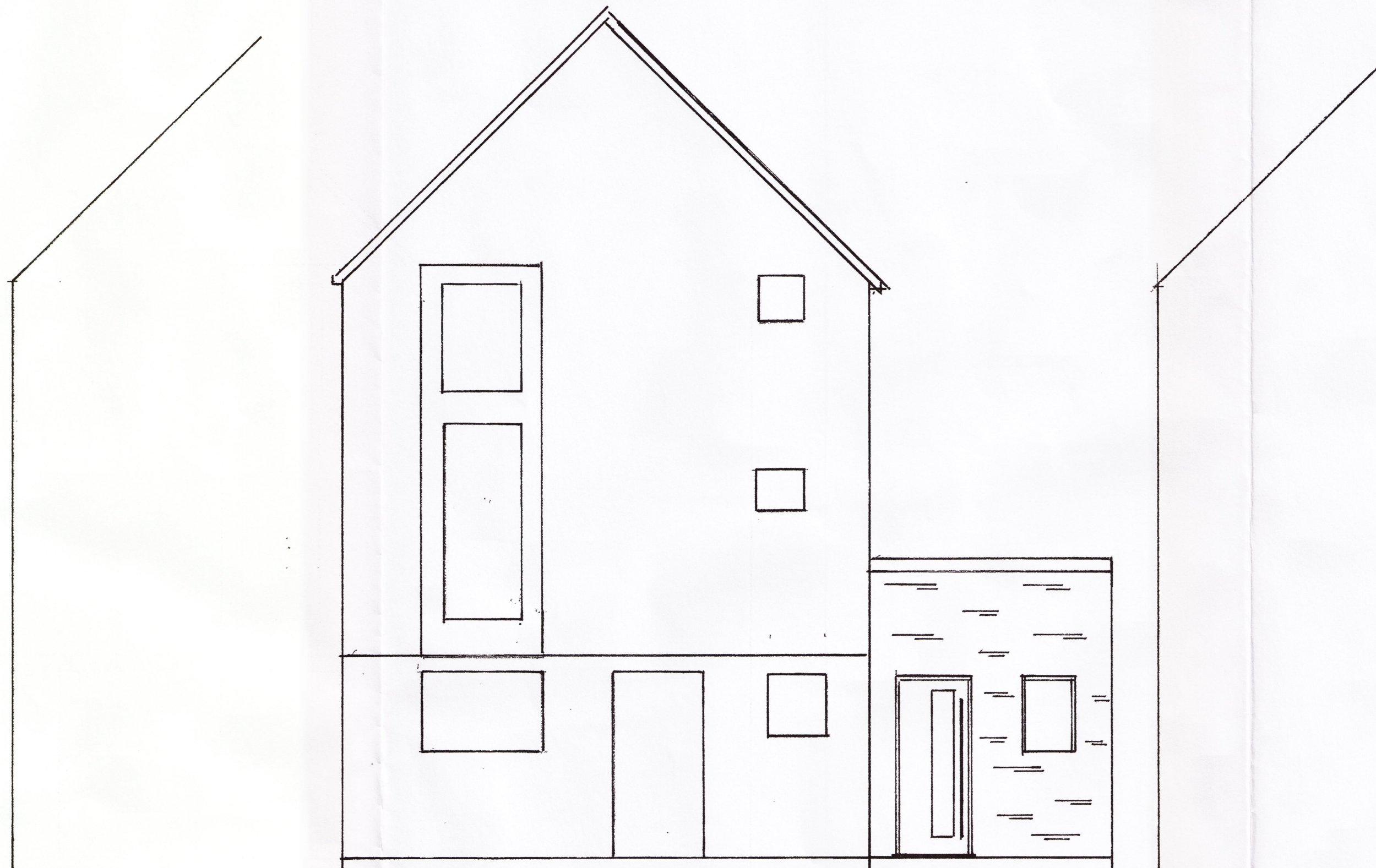
PROPOSED FRONT ELEV