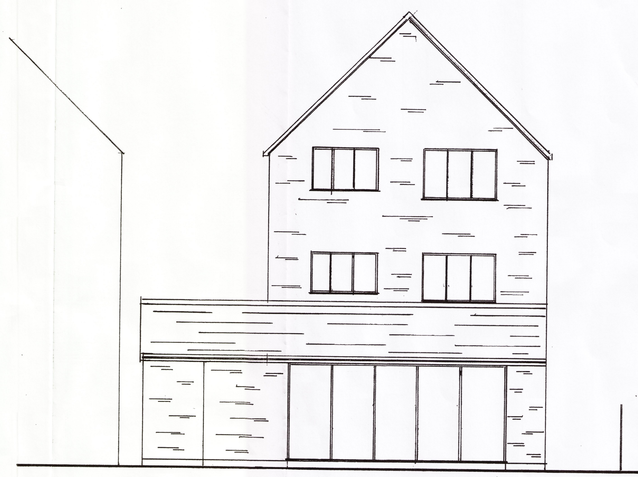
PROPOSED BACK ELEV