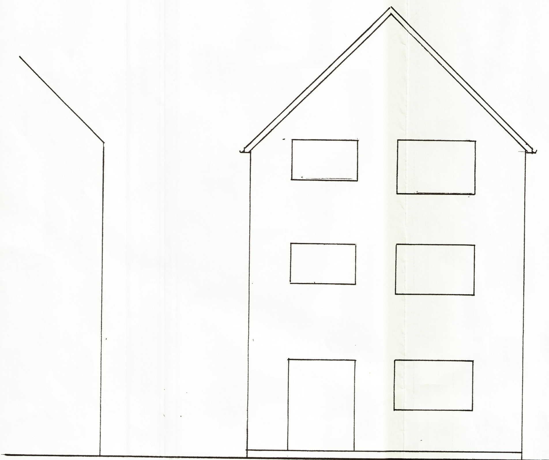
EXISTING BACK ELEV