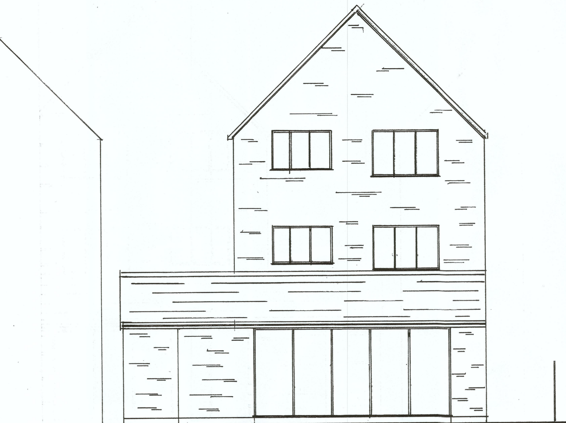
PROPOSED BACK ELEV