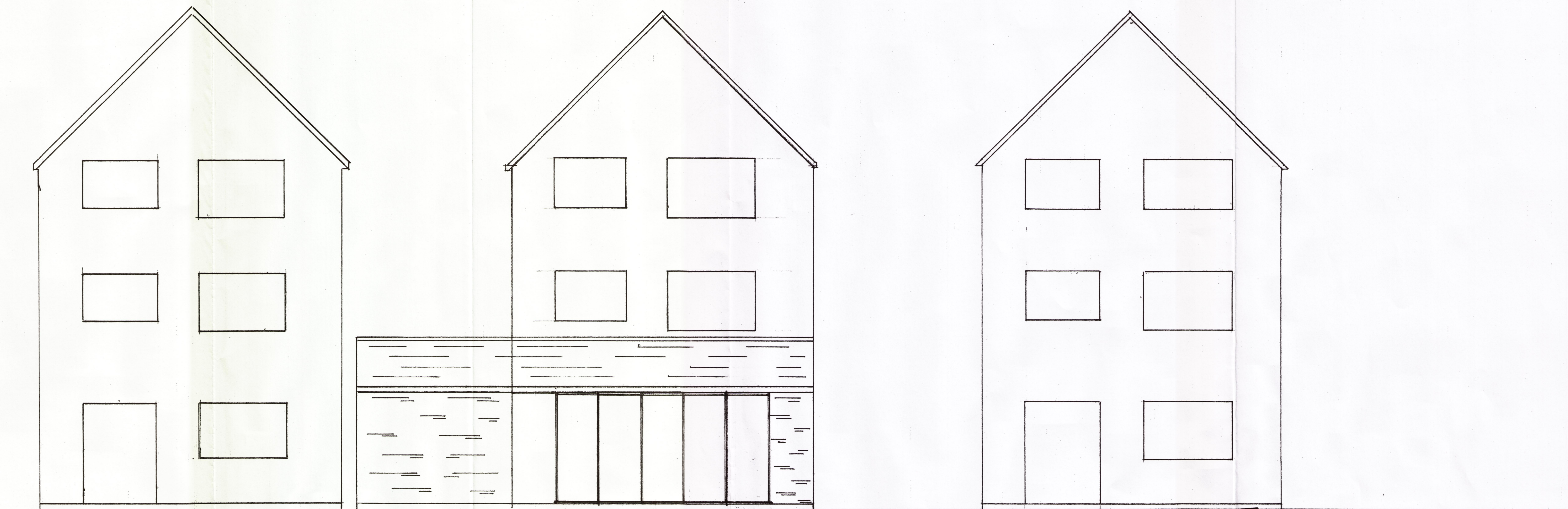
BACK ELEV 34