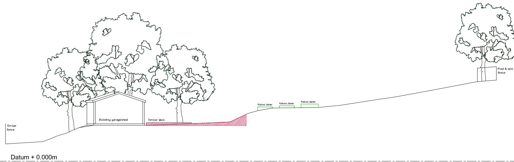
EXISTING SITE SECTION C-C