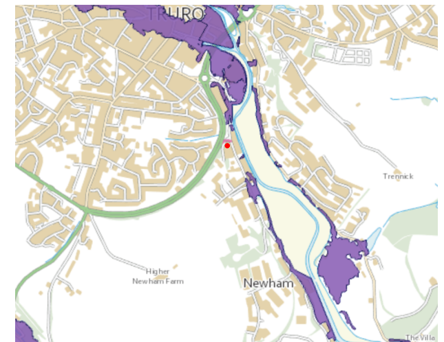
03 - Flood warning area